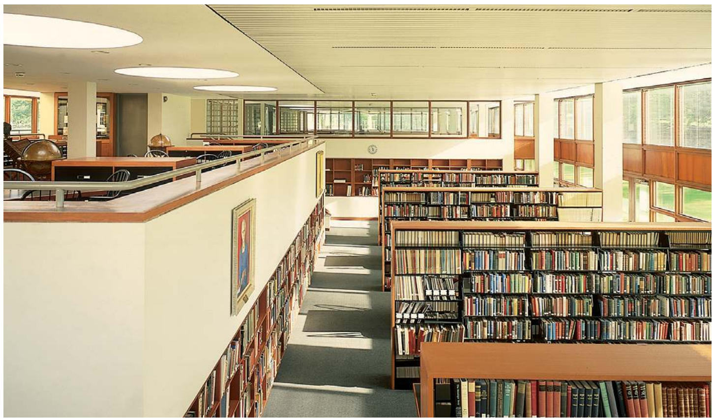
Library main reading room