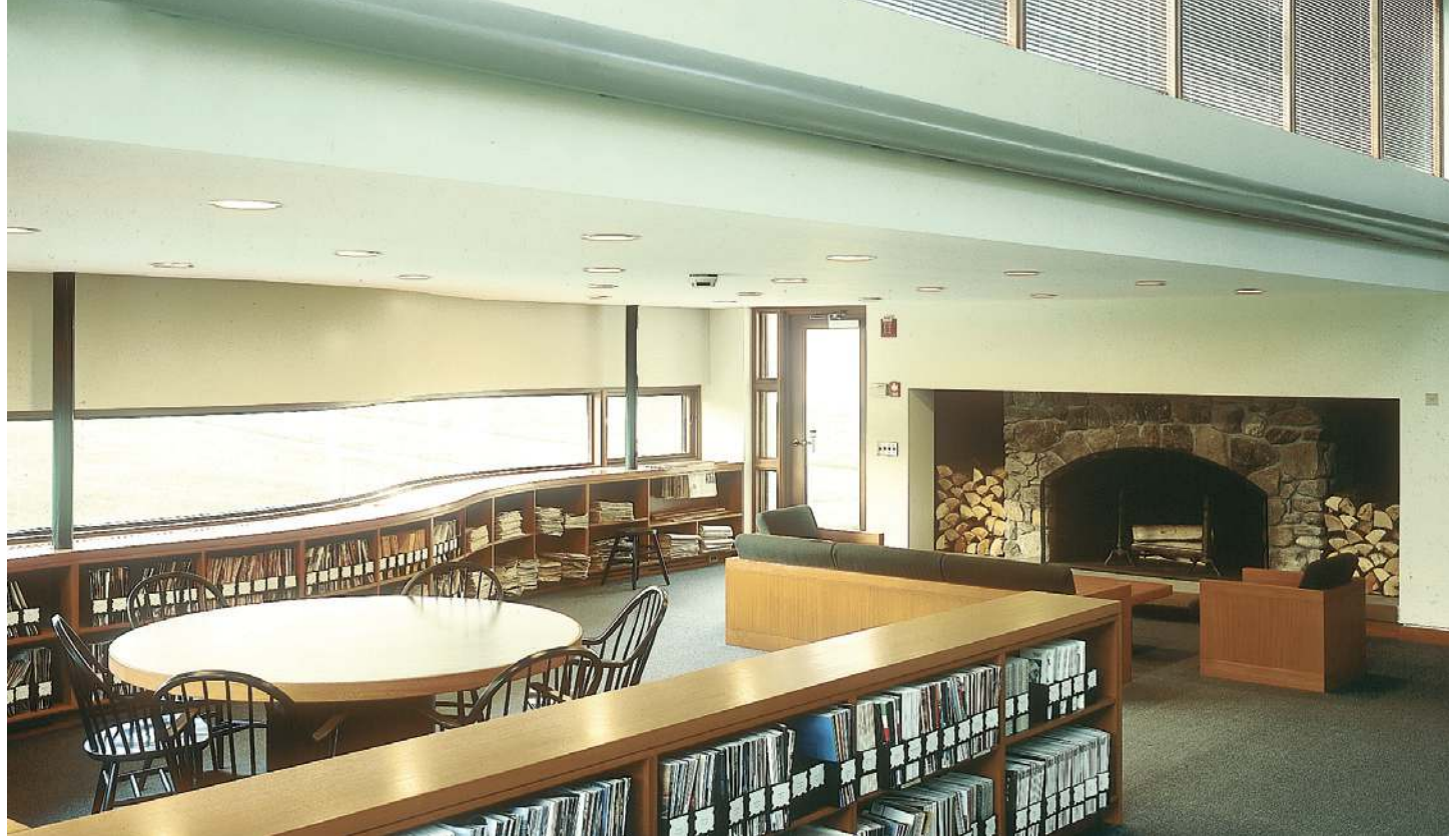
Periodical reading room