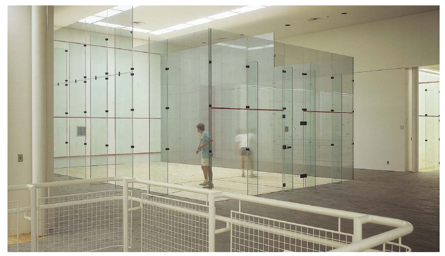
Three-glass-wall exhibition squash court