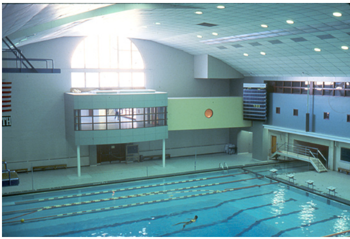
Swimming pool in renovated gymnasium