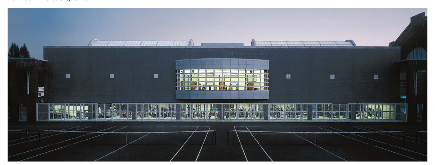
Night view of north façade from tennis courts