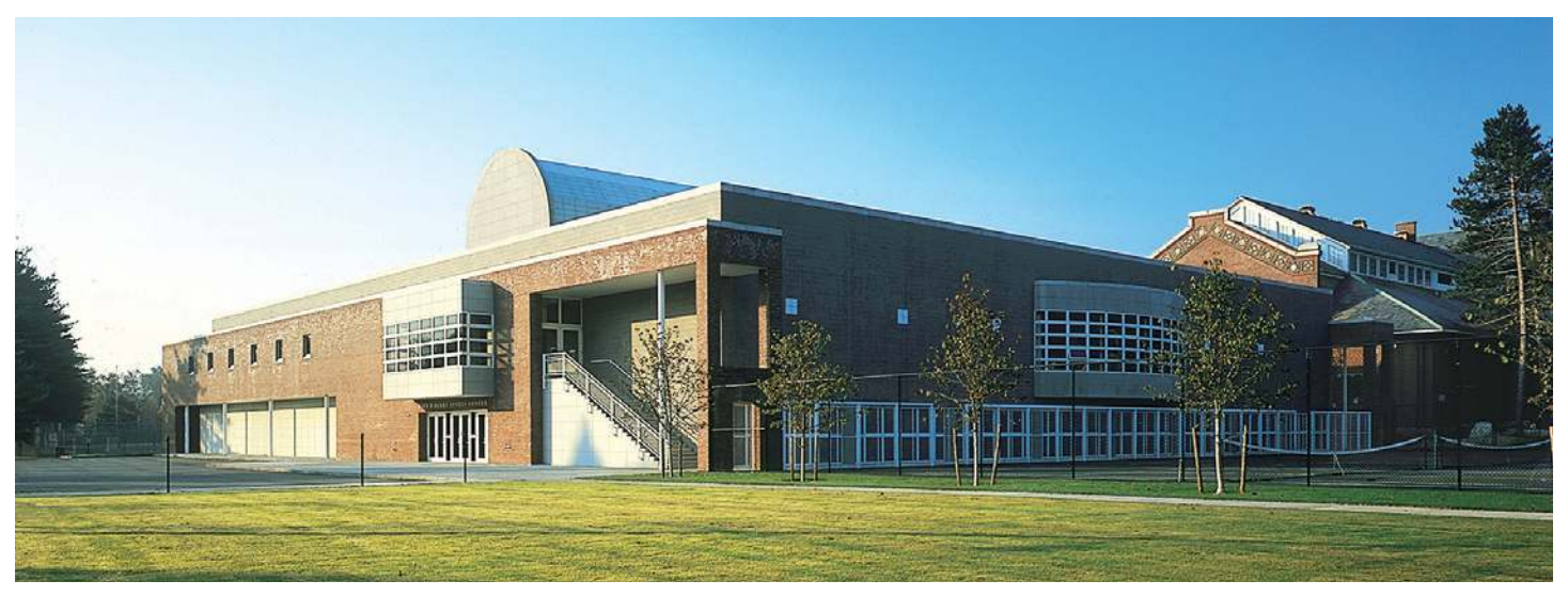
Northwest view of building from lawn