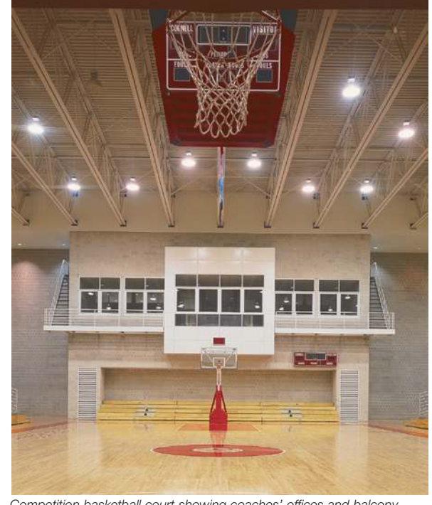
Competition basketball court showing coaches' offices and balcony

• completion 1990 gsf 180,000 construction cost $14,000,000