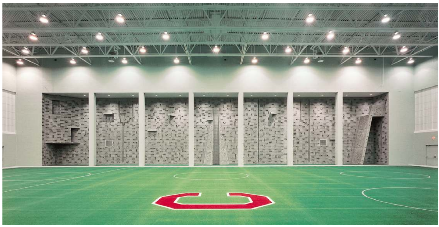
Fieldhouse and climbing wall