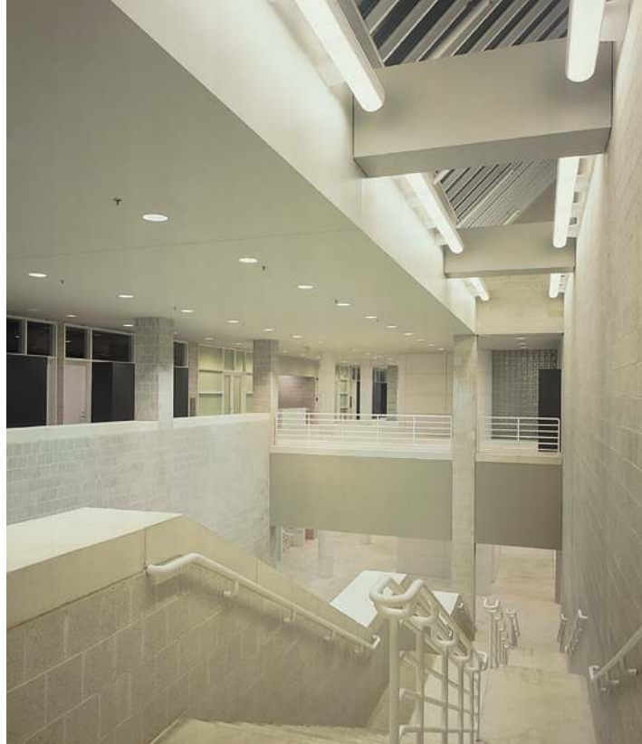
Entry arcade Lobby and public stairs