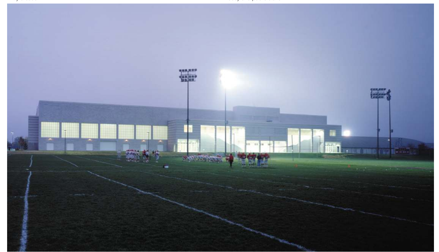
North façade from practice fields