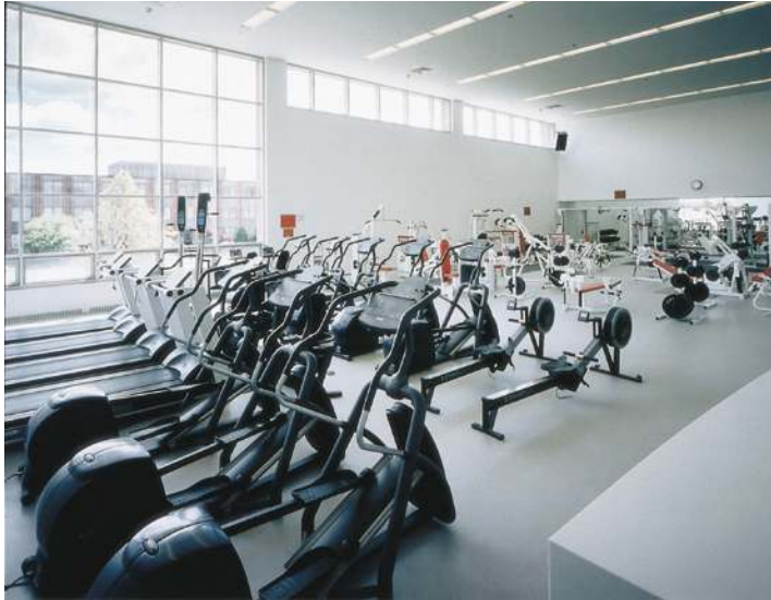
Weight training room