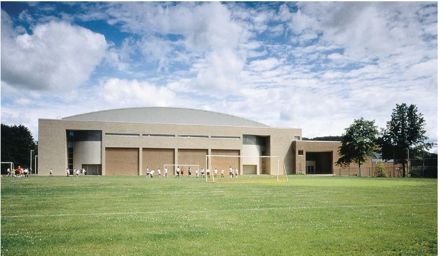
View from soccer field