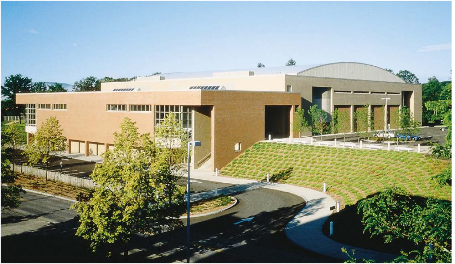
Pedestrian/Vehicular approach from academic campus