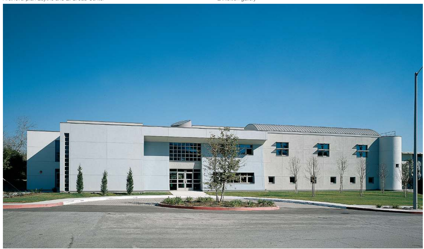
Edythe and Eli Broad Center, west façade public entry