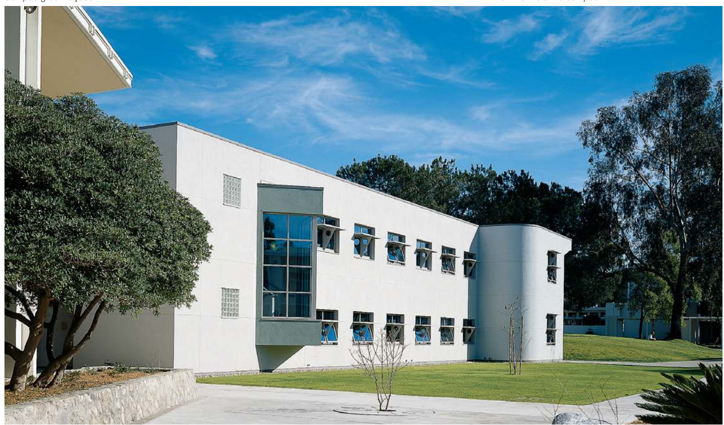
View from existing building to campus green