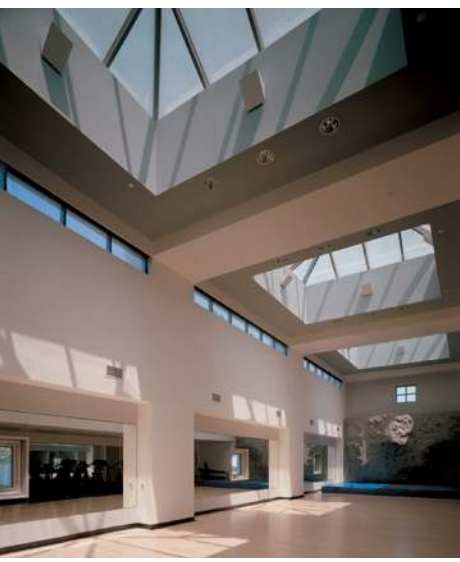
Flexible exercise span