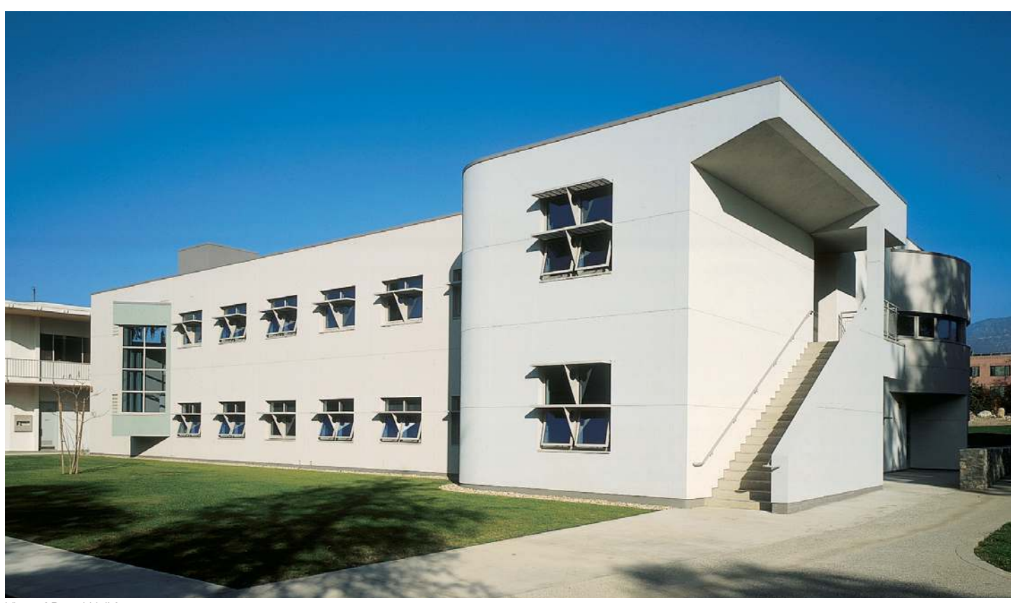
View of Broad Hall from campus