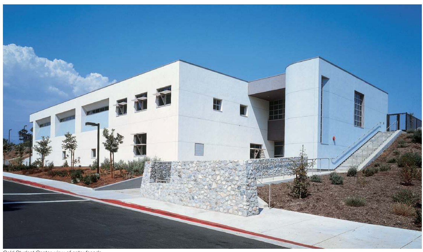
Gold Student Center, view of entry façade