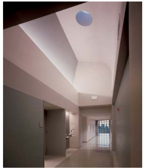
Second floor gallery