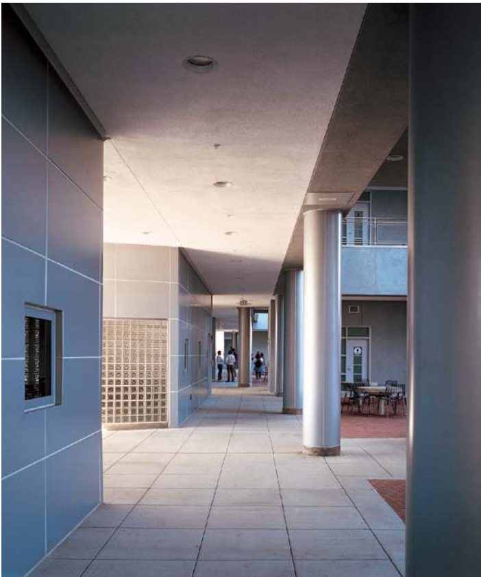
Ground level arcade and circulation balconies