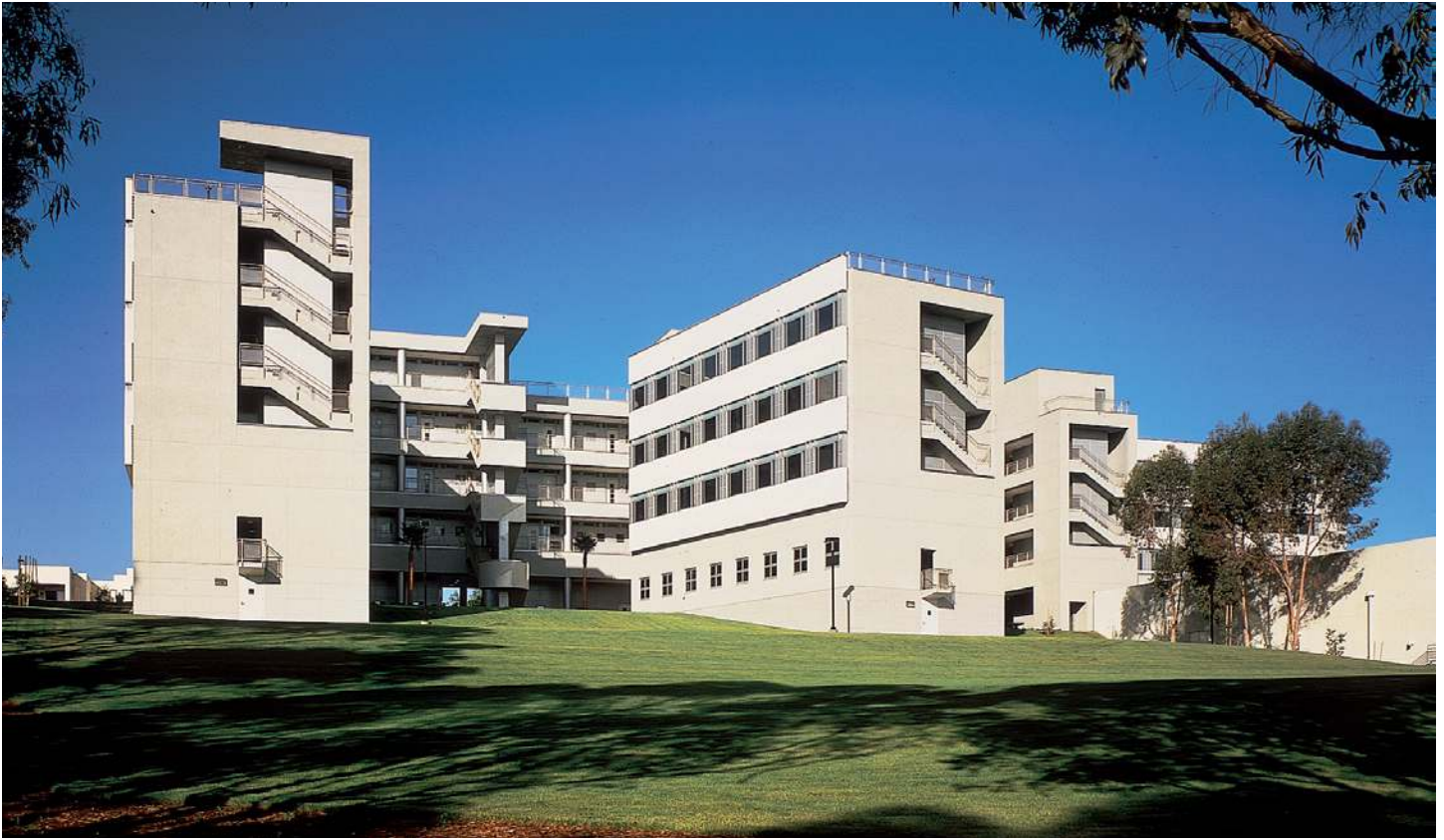
View from east

Social Sciences Building and Super Computer Office Building