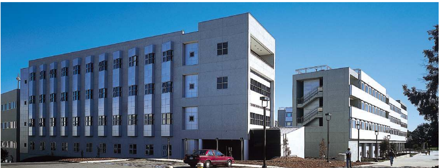
Computer Center office addition from northwest