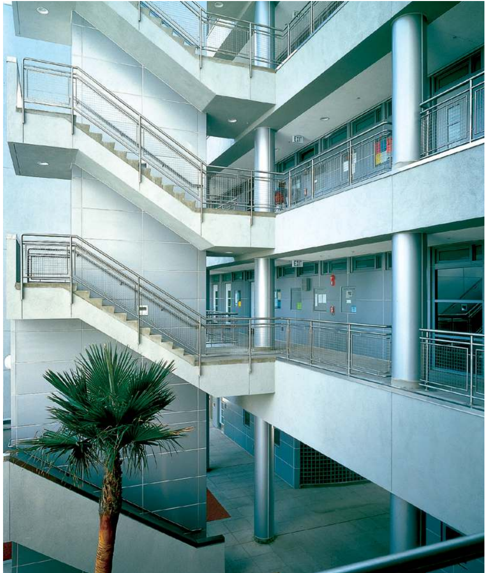
Detail of exterior stair