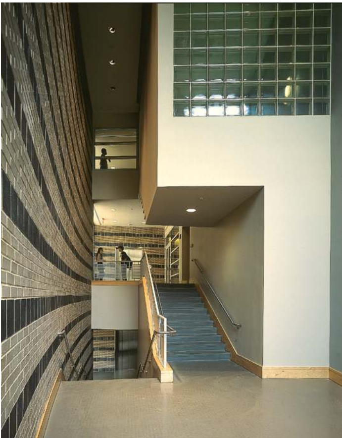
View of interior stair