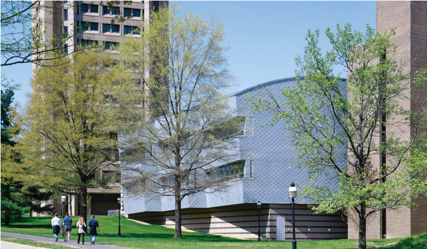
View from southwest