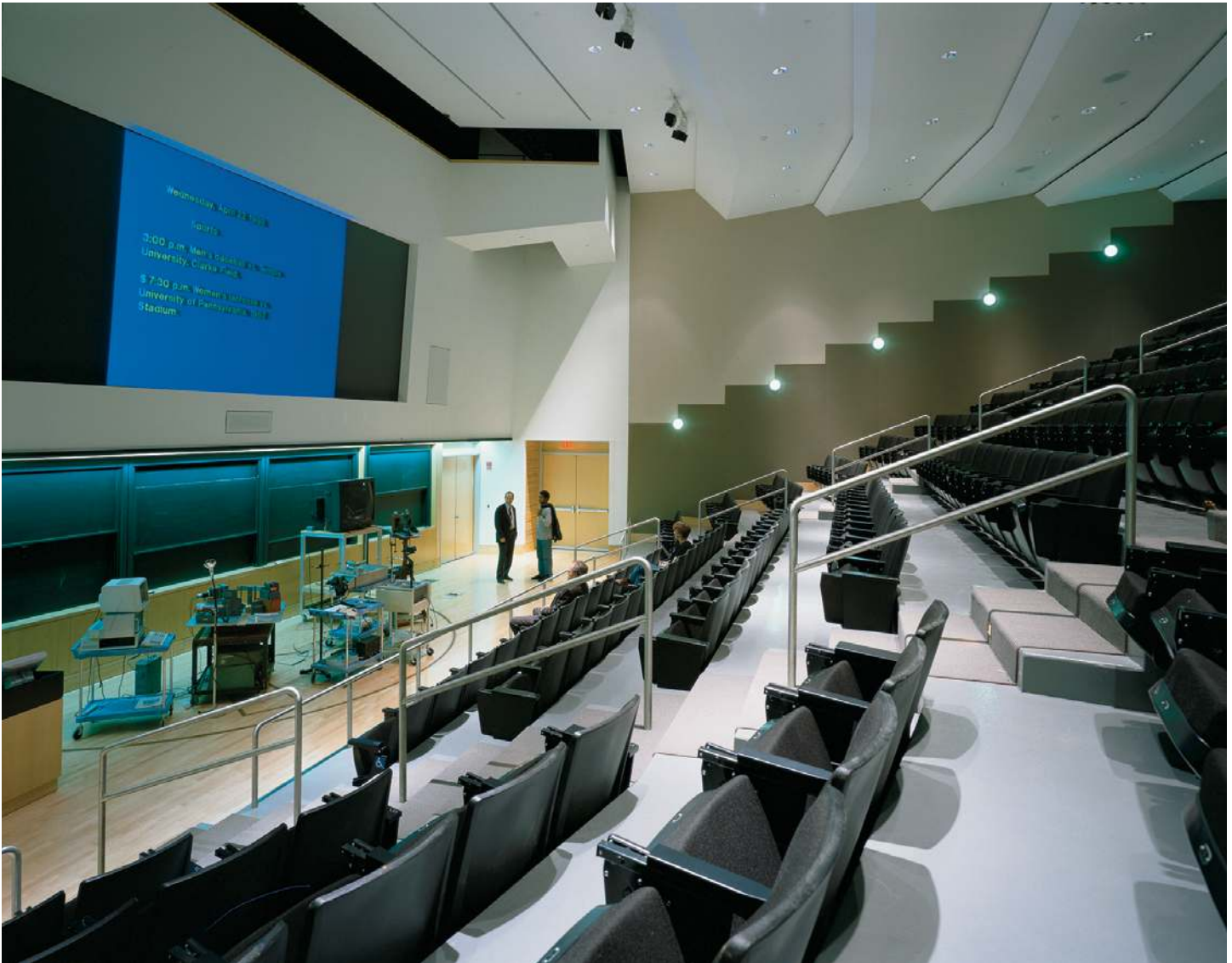
Lecture hall with rear projection facilities and turntable stage