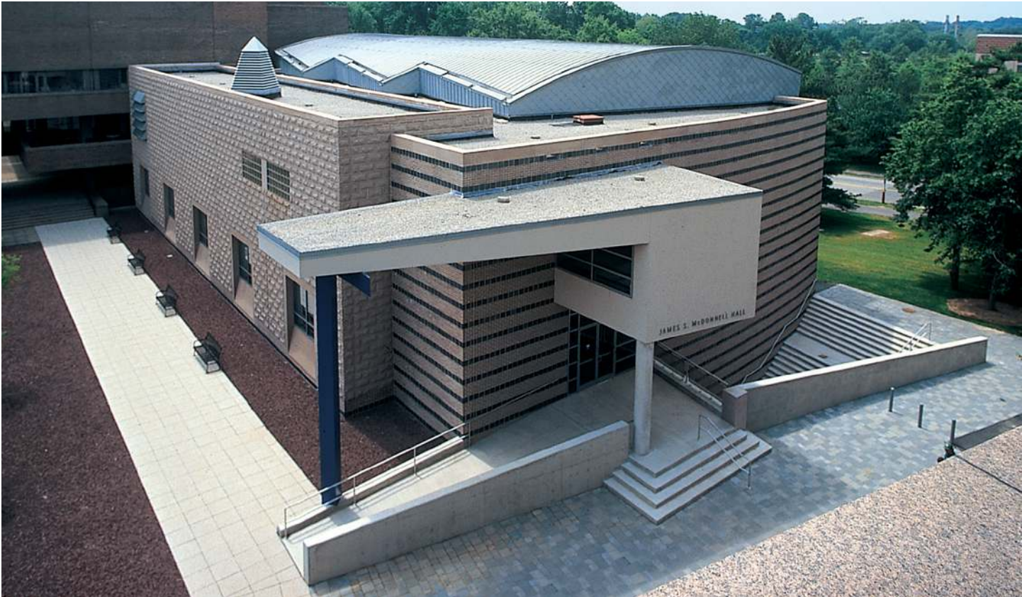
View from northeast