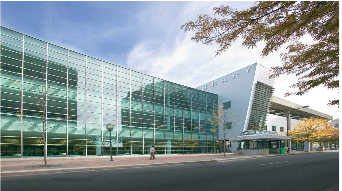
View looking southwest along Main Street