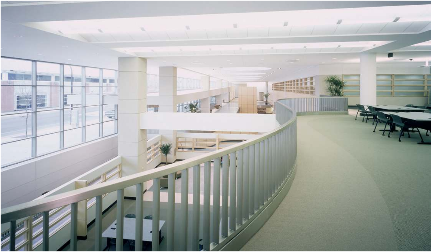
View of reading room and bridge to parking garage