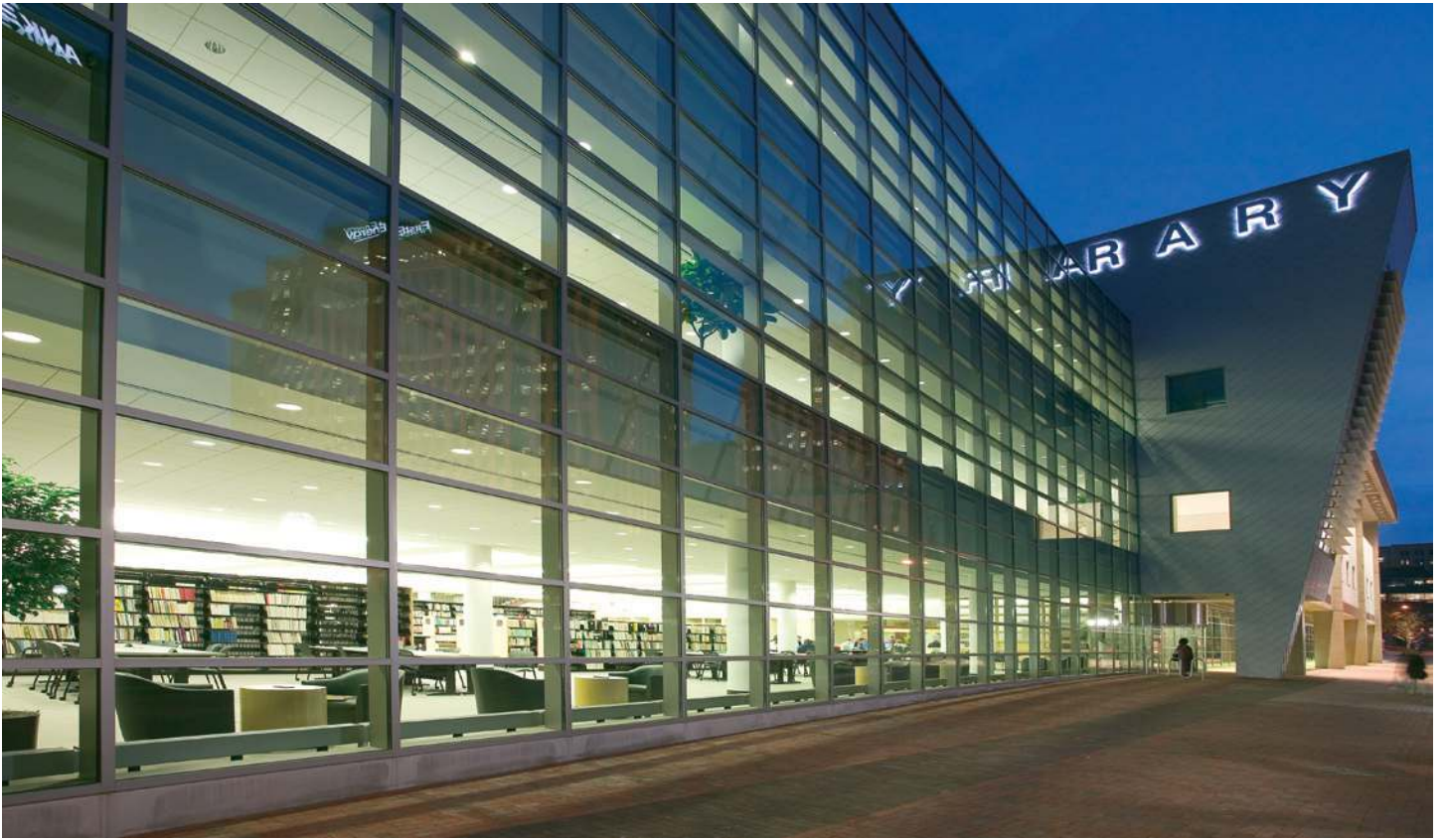
View looking south along Main Street