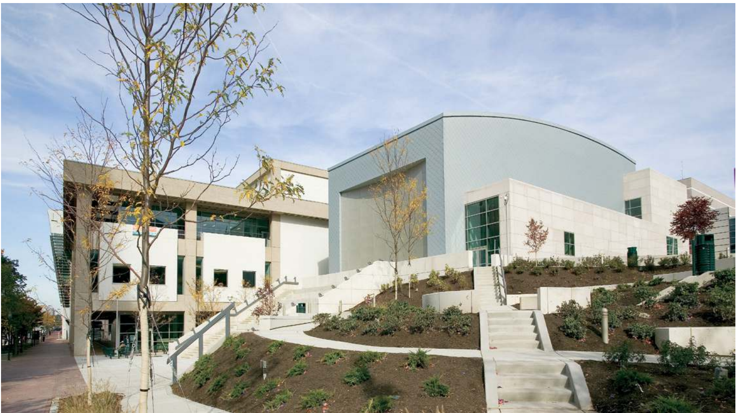
View looking north from Library Park