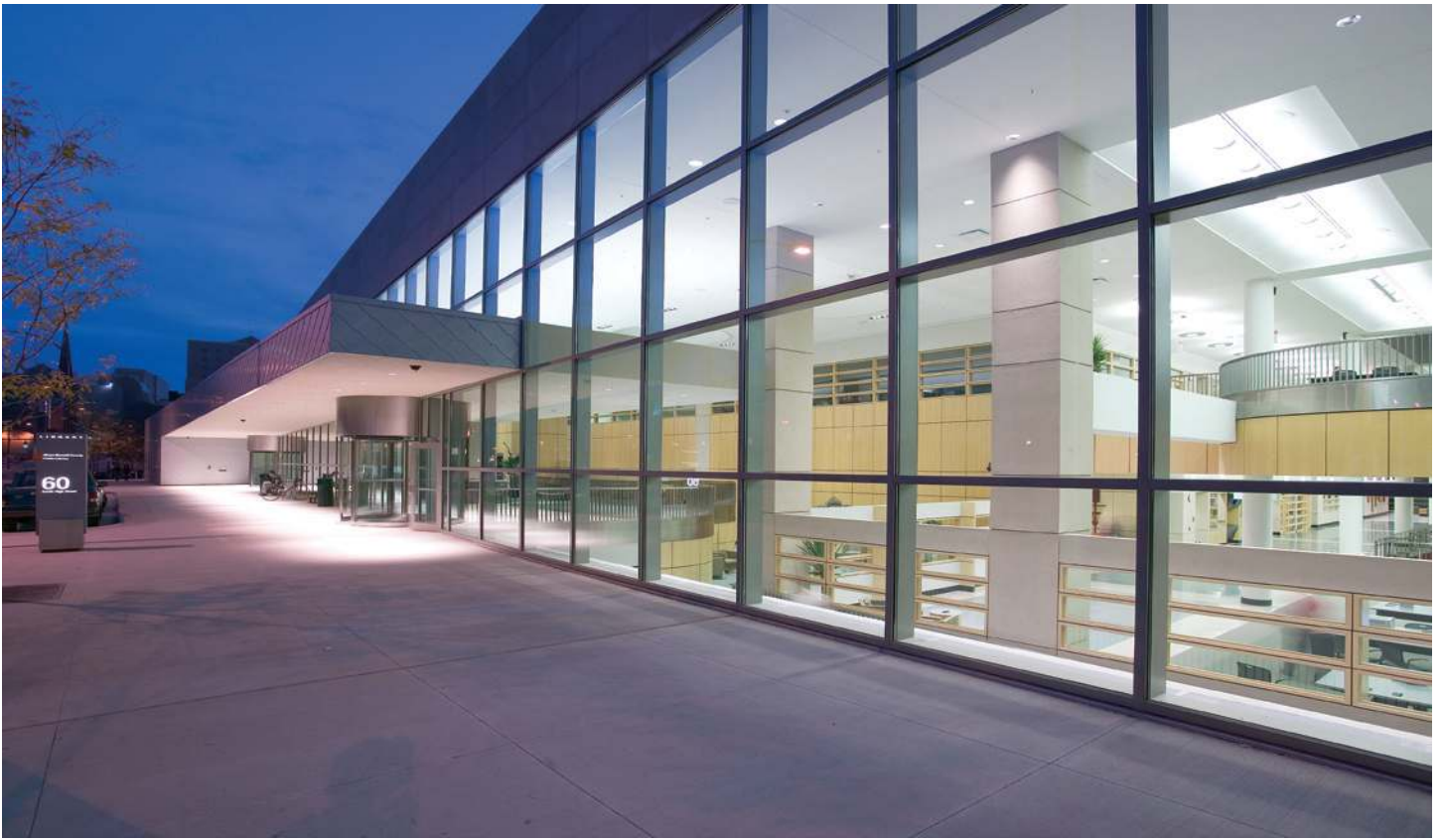
View looking south along High Street