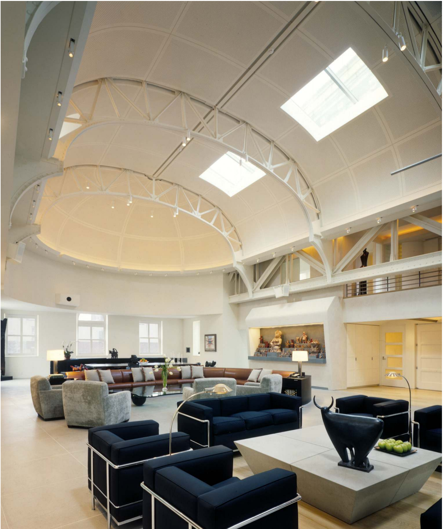
View of living/dining from master bedroom