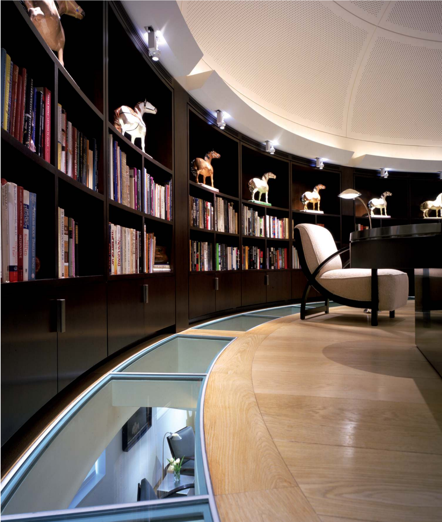
Library with master bedroom below