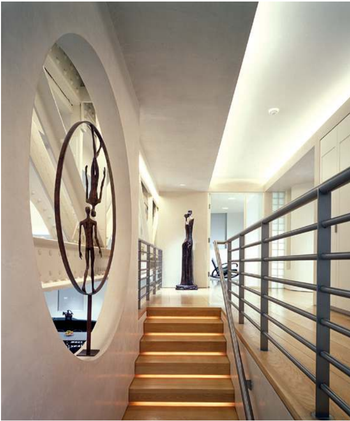
Second level balcony