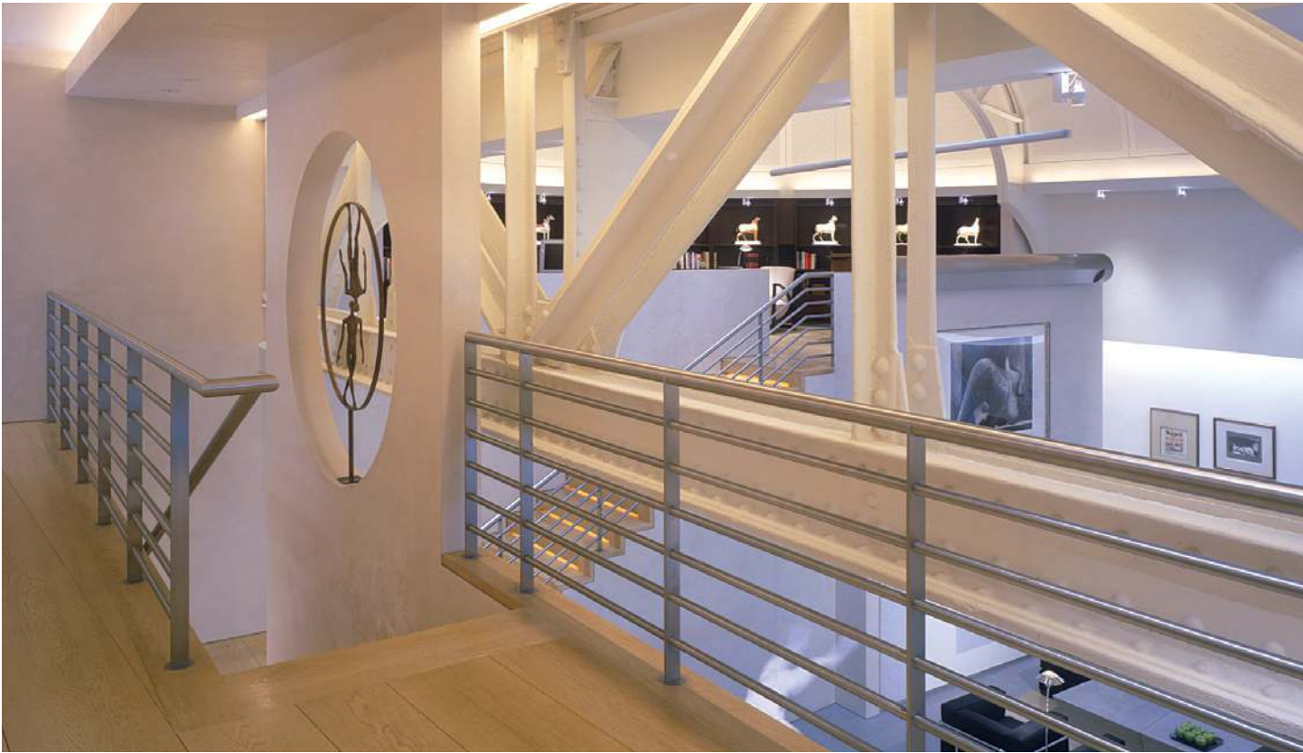
Second level balcony overlook