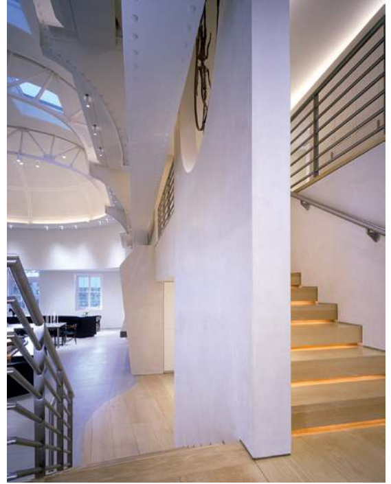
Stair to second level