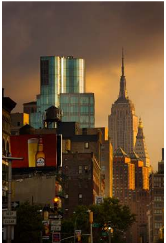
Building in context, looking north