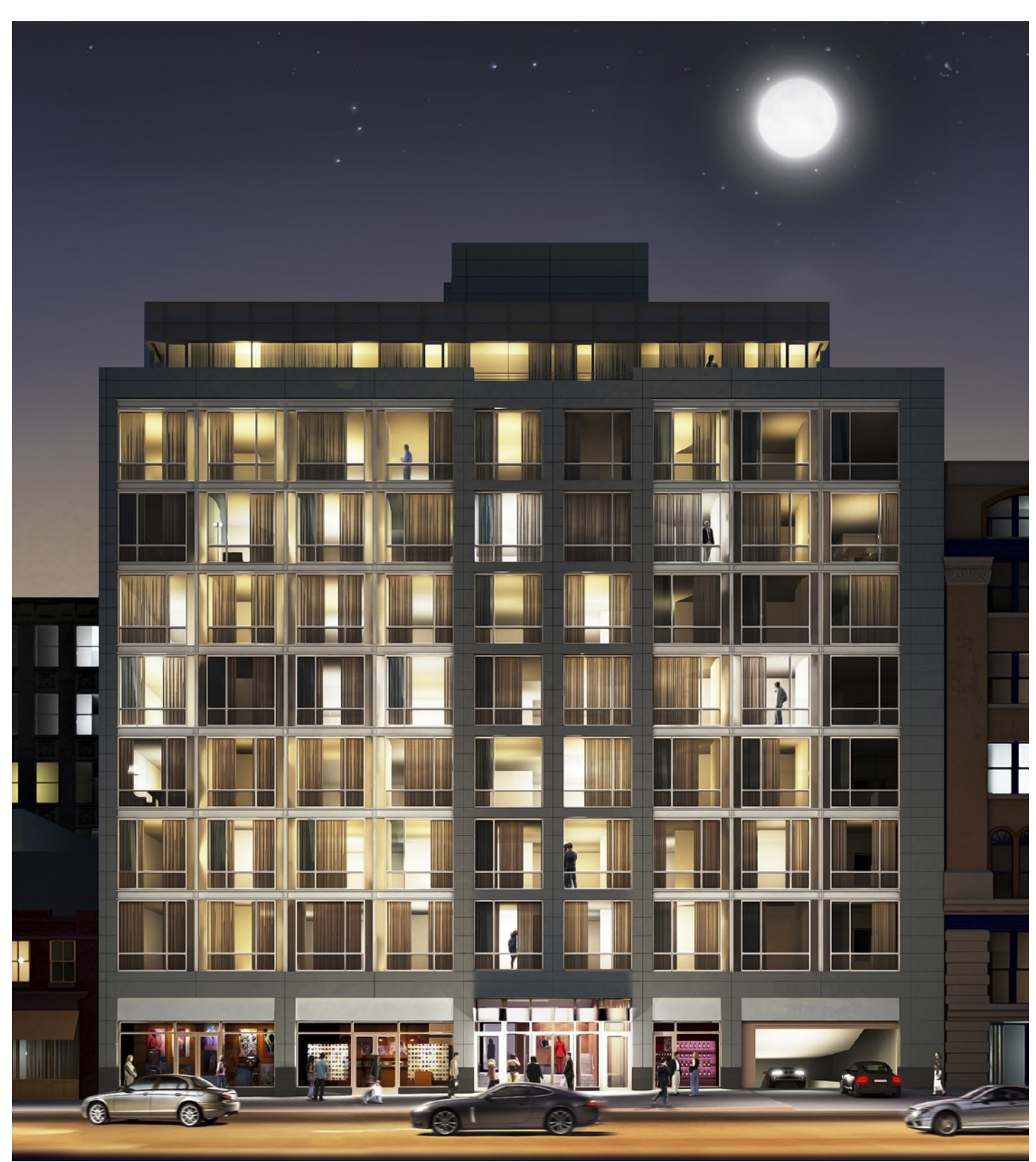
West Broadway façade