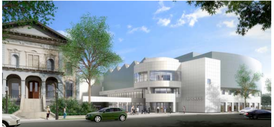
The Crocker Art Museum.

SACRAMENTO, CA.- The Crocker Art Museum officially broke ground today on its 125,000-square-foot expansion with a ceremony involving city and county officials and donors to the project. The groundbreaking begins a nearly three-year construction and move-in process with a grand opening expected in early 2010. The museum remains open throughout construction.