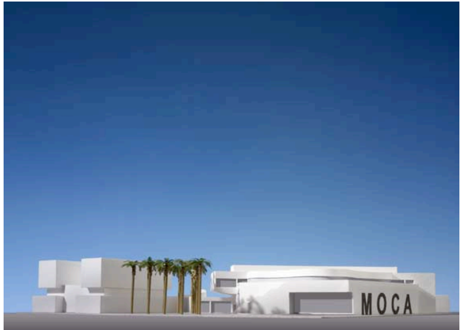
Concept plan by Charles Gwathmey for expansion of Museum of Contemporary Art, North Miami.

NORTH MIAMI, FL.- The Museum of Contemporary Art (MOCA) unveiled architectural plans for the expansion and renovation of its Joan Lehman Building in North Miami during a presentation at the museum. The expansion, designed by world-renowned architect Charles Gwathmey, triples MOCA's current exhibition space in North Miami and offers the public ongoing access to its permanent collection. The 24,000 square-foot expansion (20,000 square feet of new and 4,000 square feet of remodeled space) of MOCA's current 23,000 square foot facility also will include such features as an education wing, expanded space to present concurrent exhibitions and public programs, new art storage facility, and enhanced public areas.