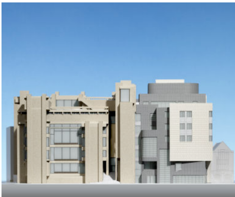
Gwathmey Siegel & Associates Architects.