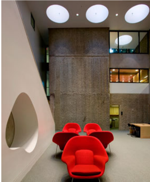
Yale University arts complex, view from the east, 2008. Yale University, Robert B. Haas Family Arts Library, basement; view of Great Hall, 2008.

"To see Rudolph's masterpiece restored to its original glory and to see students once again working in its light-filled spaces, is exhilarating," says Robert A.M. Stern, the prolific architect and dean of the Yale School of Architecture. "We hope that the restoration of this building—designed by one of the most talented, inventive, and important architects of the last century—will call attention to the pressing need to preserve both Paul Rudolph's work in particular, and great modern architecture in general."