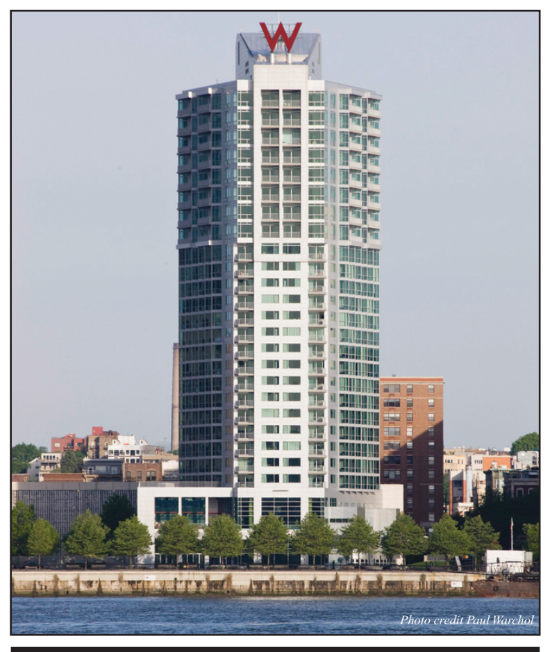
W Hoboken Hotel & Residences, Hoboken, N.J.

Across the river, the recently completed Soho Mews, at 311 West Broadway, is a residential condominium in New York City's Soho Cast Iron Historic District. The two-building project consists