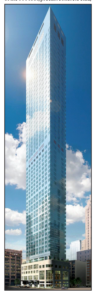
W New York-Downtown Hotel & Residences, New York, N.Y.

the street, atop a 10-story podium. The limestone-clad podium is designed to relate directly to the surrounding streetwall buildings including the landmarked Tiffany, Gorham and adjacent 404 Fifth Avenue buildings, in terms of scale, rhythm, and materiality. The design of the 600 foot, precast concrete clad,