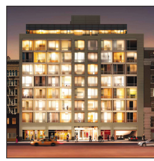
Soho Mews, 311 West Broadway, New York