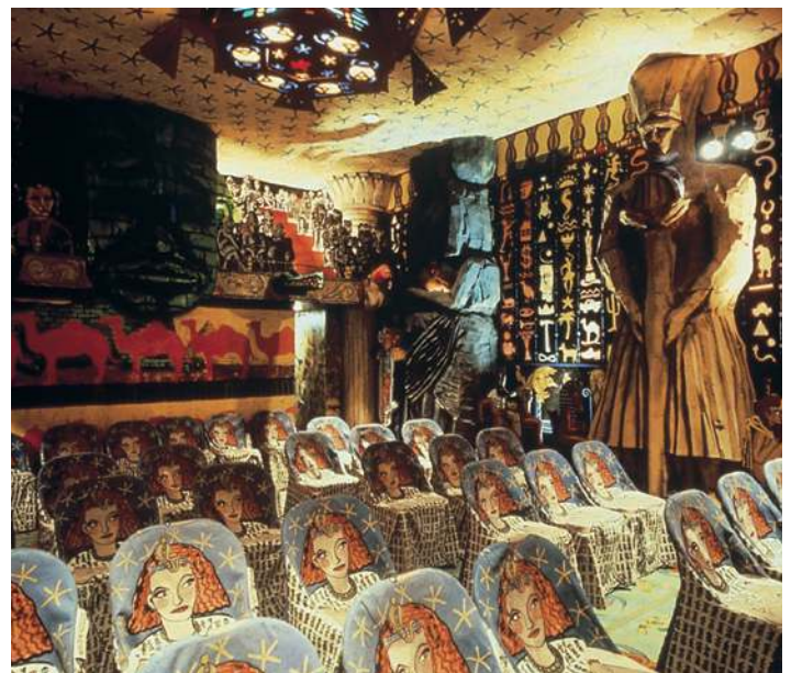
Koolhaas Haass + Partners' "Tuts Fever Movie Theater Palace"