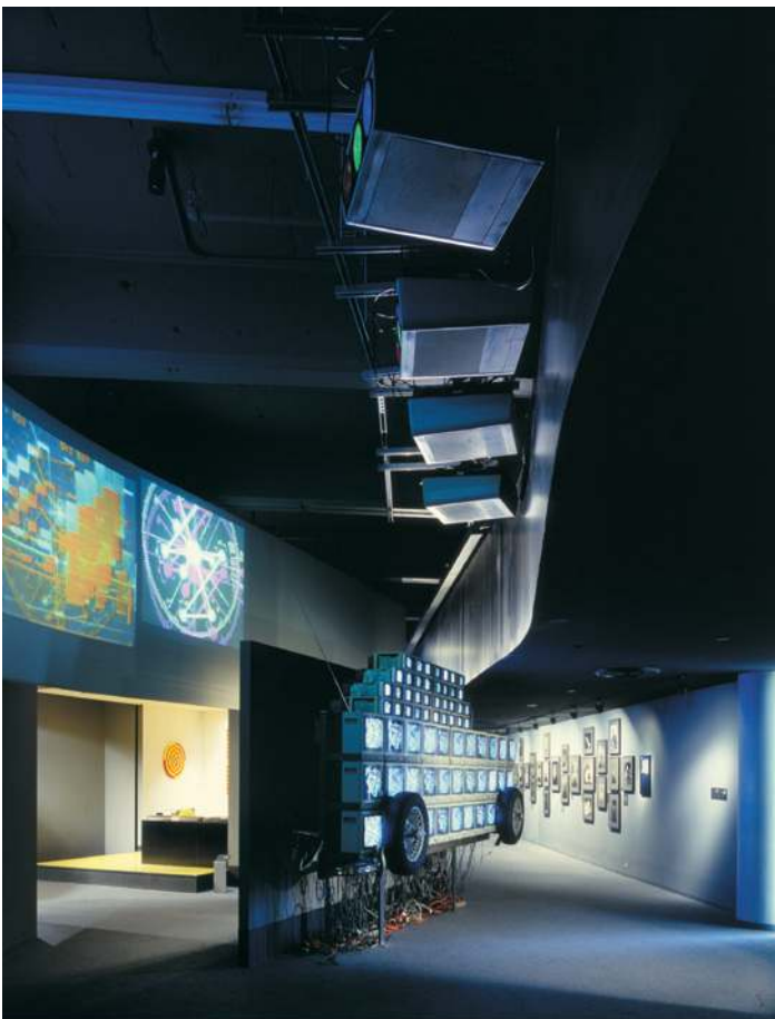
Typical exhibition gallery on second level