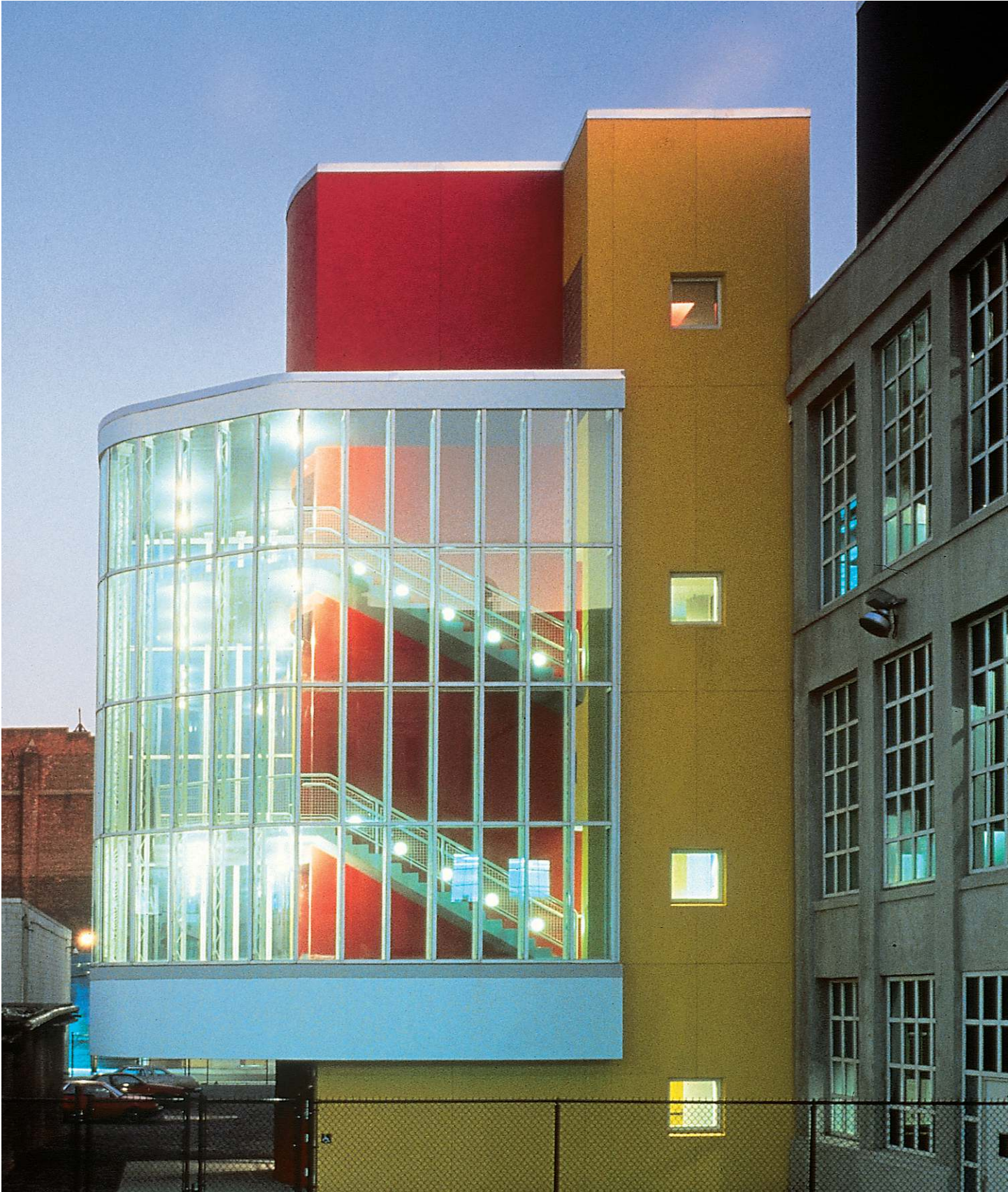
Stair tower from courtyard