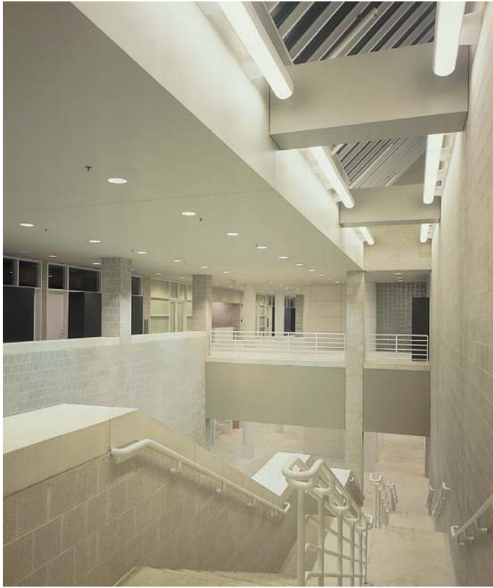
Lobby and public stairs