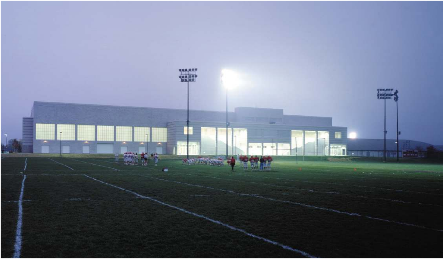
North façade from practice fields