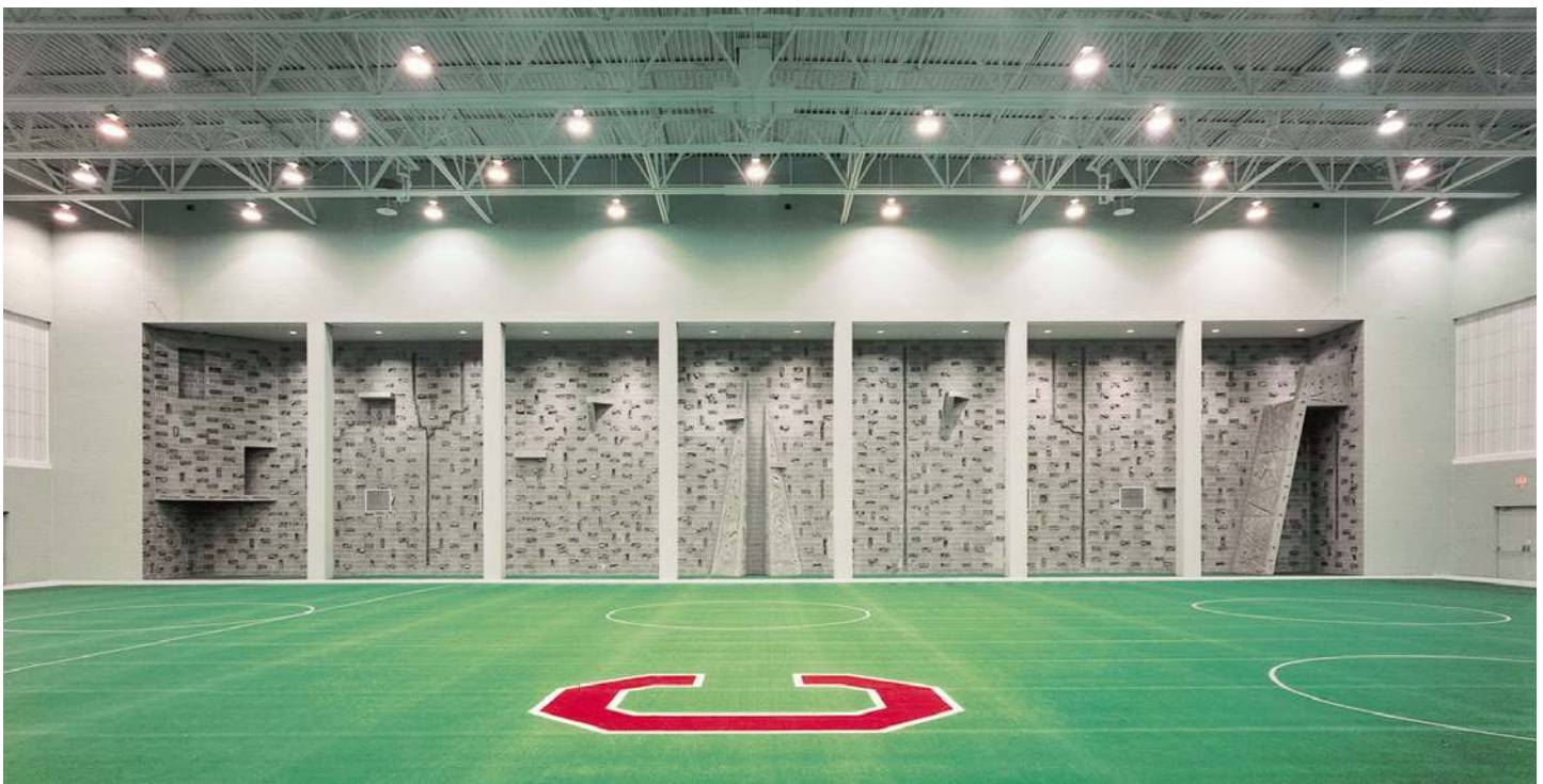
Fieldhouse and climbing wall