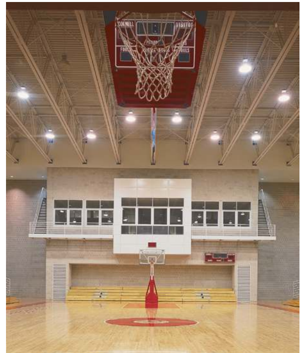
Competition basketball court showing coaches' offices and balcony