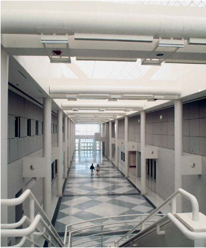
View from the Atrium Bridge