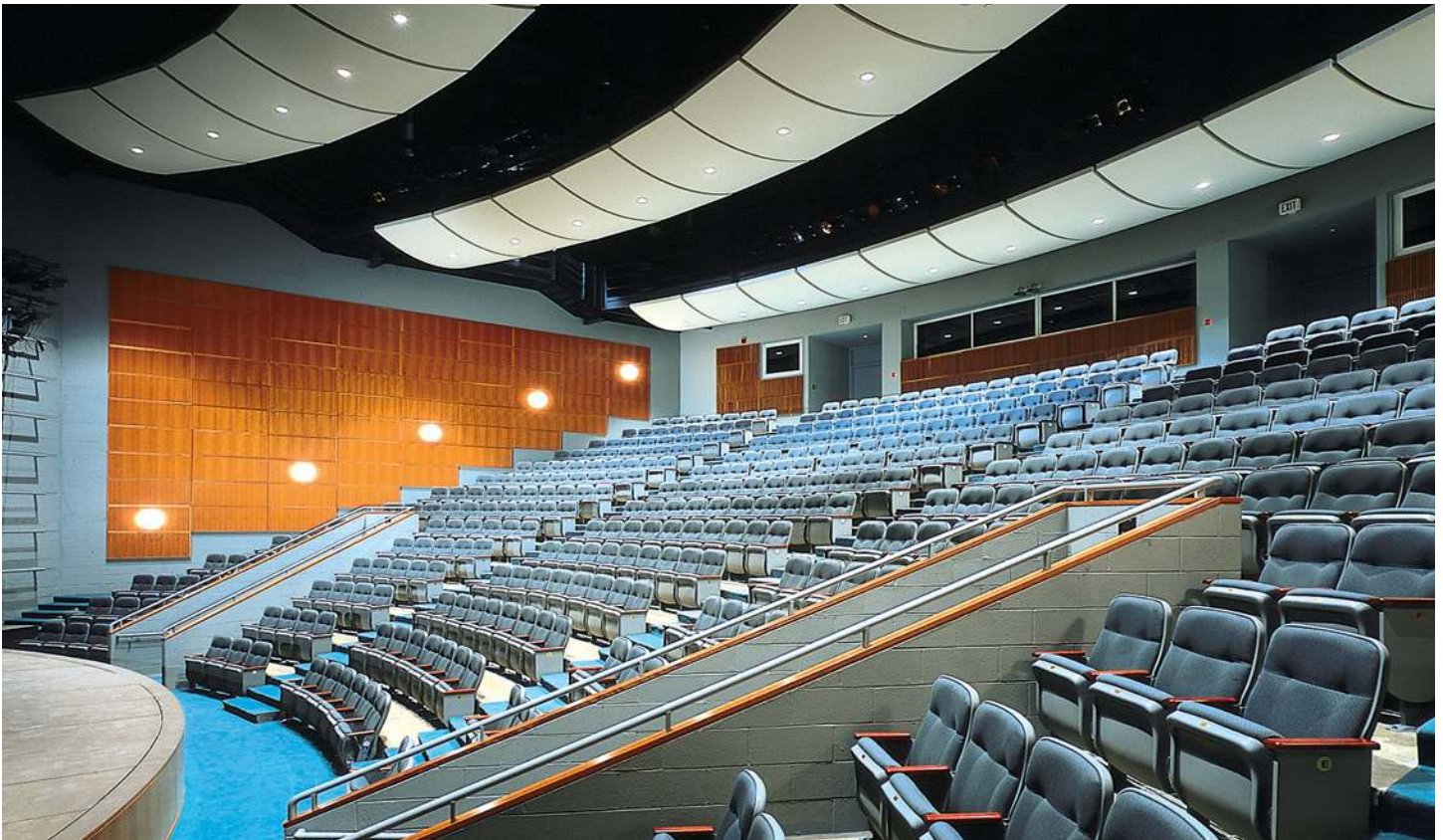
400 seat drama theater