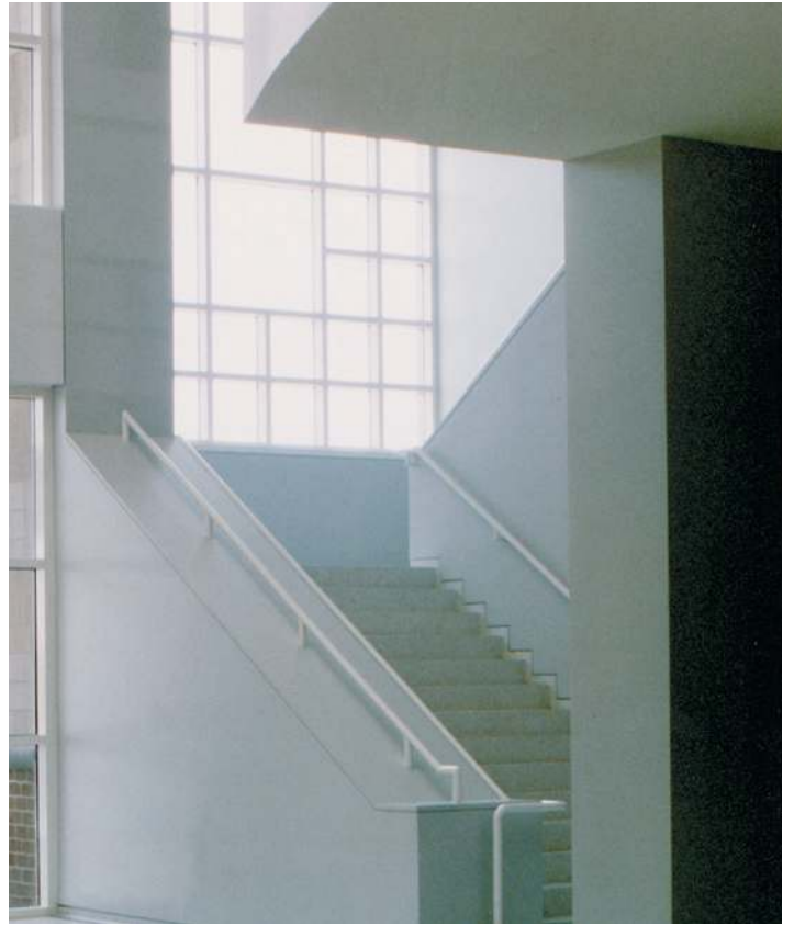
Detail of main stair