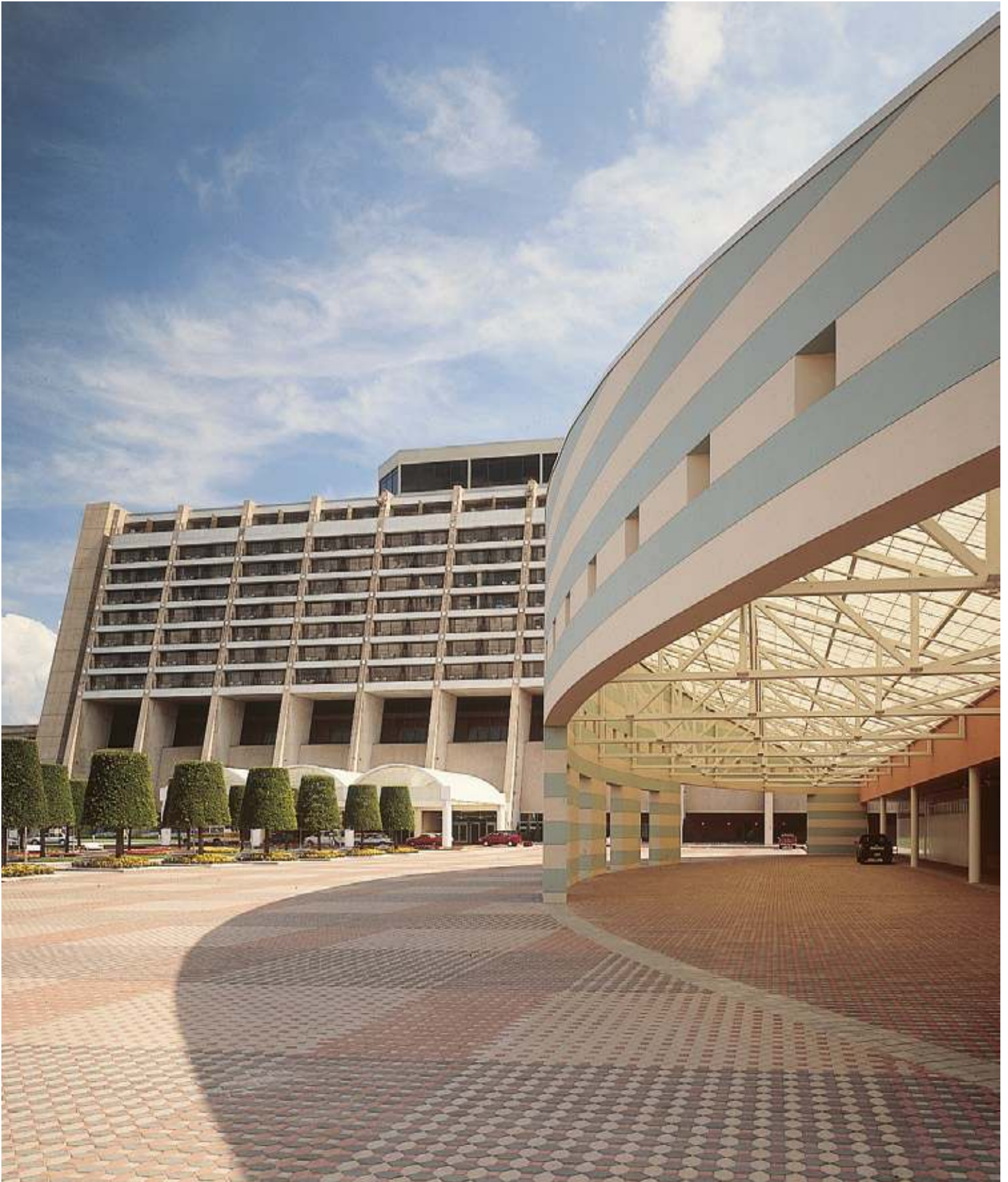
Entry plaza and vehicular entry arcades

Convention and Exhibition Center Lake Buena Vista, Florida