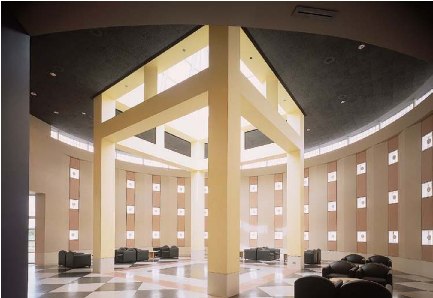
Interior of North rotunda