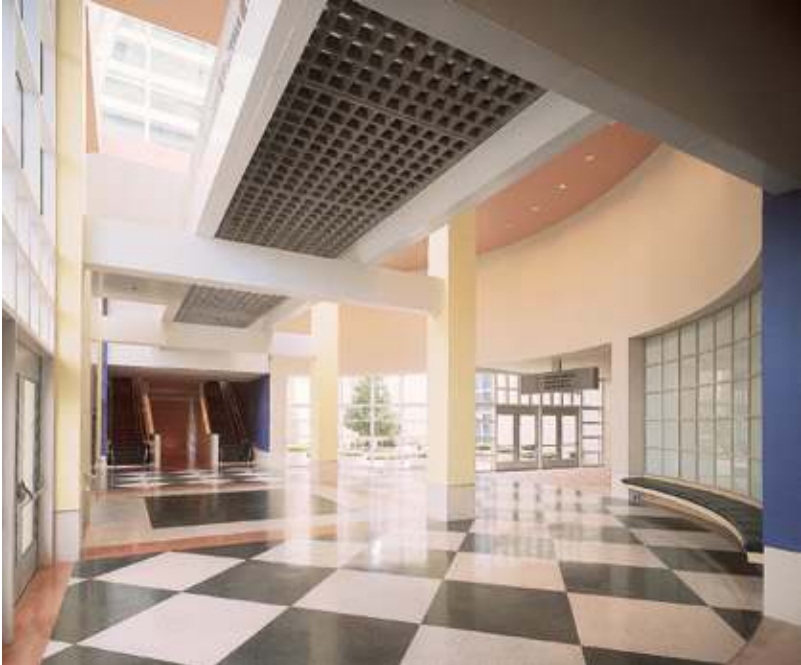
South rotunda with escalator and bridge connection to hotel