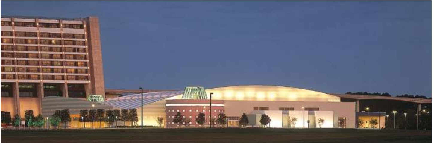
Overall view from Lake Buena Vista