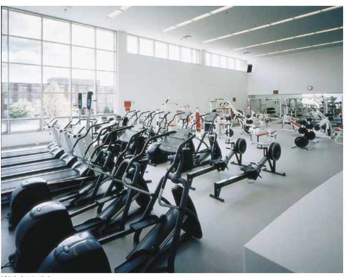
Weight training room