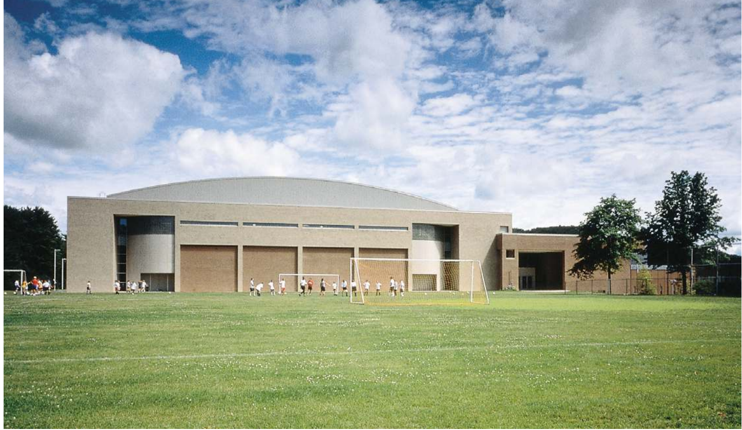
View from soccer field