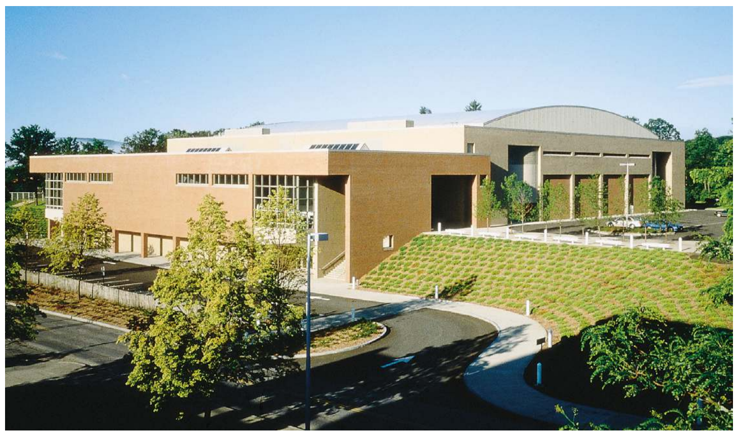
Pedestrian/Vehicular approach from academic campus