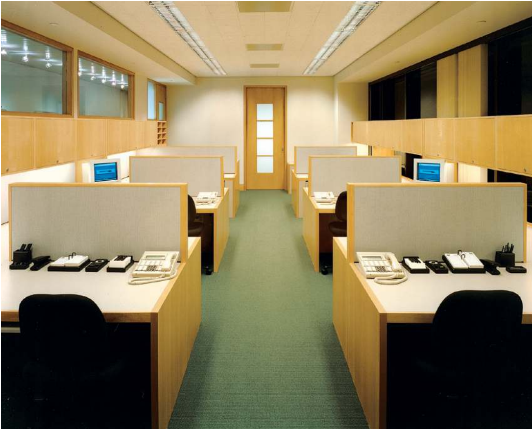
Typical bullpen workstations