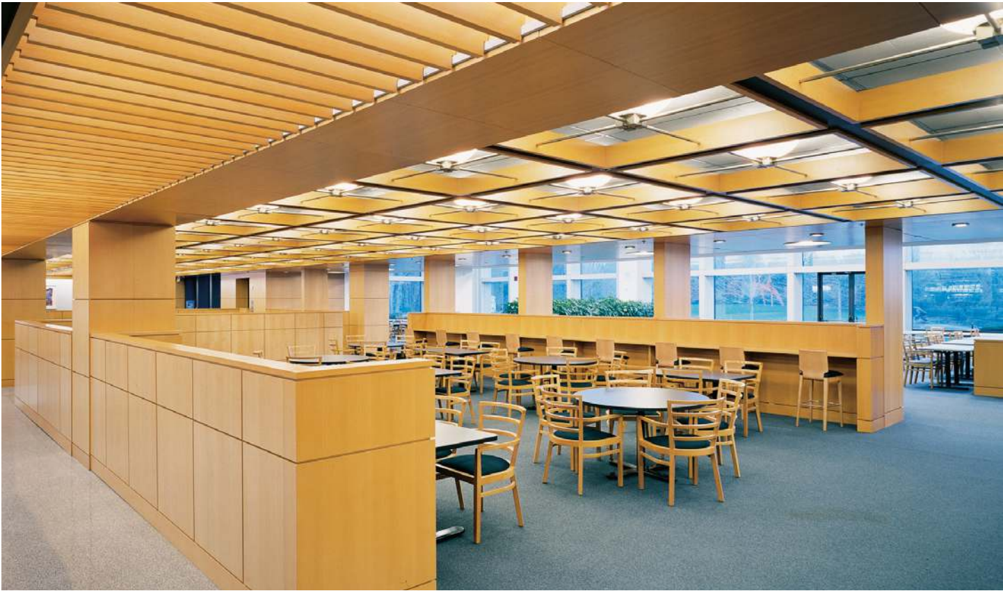
Renovated Dining Room with view to Addition