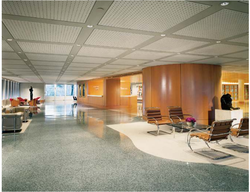
Main lobby, reception