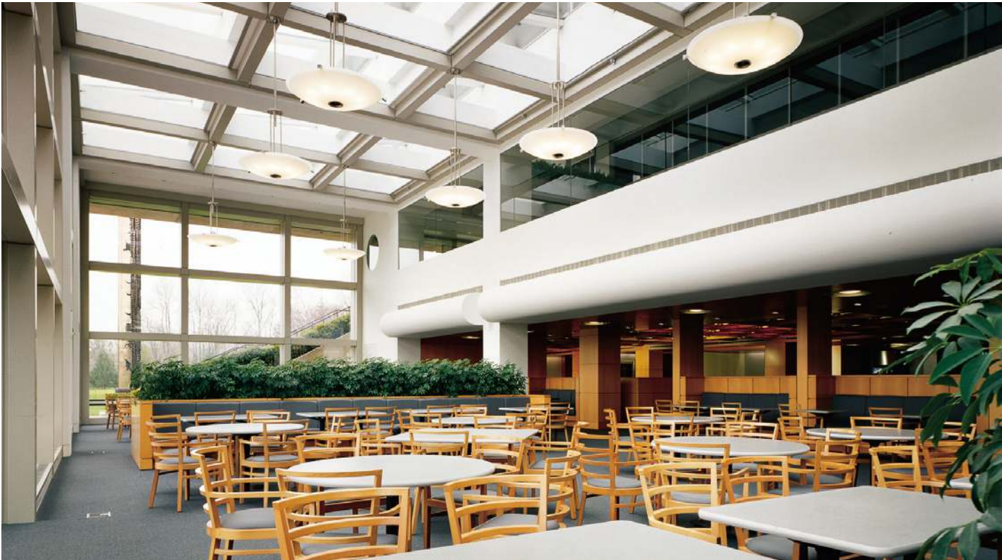
Dining Room Addition