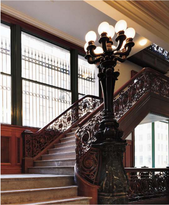
Restored library stair