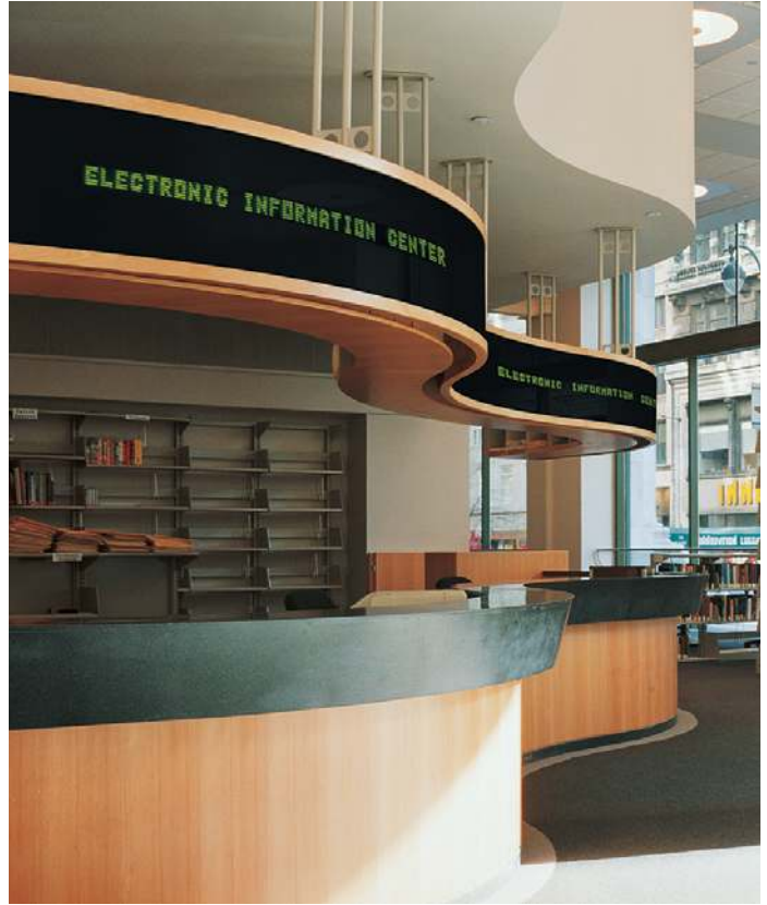
Service desk, first floor