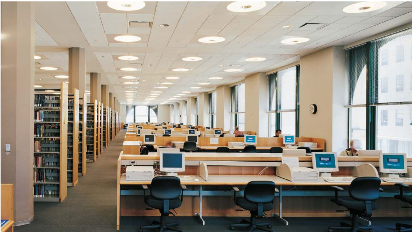
Mina Rees Library, second floor