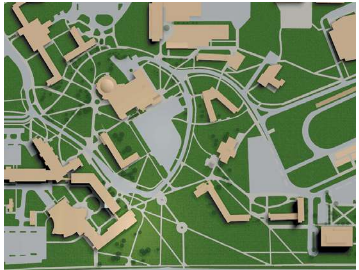
Site plan before