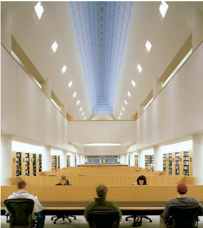
Upper reading room atrium