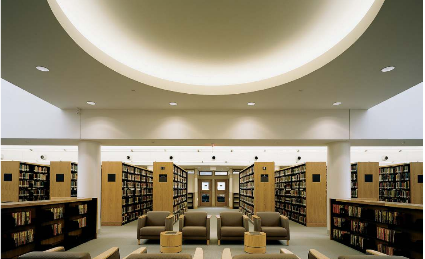
Reference reading room