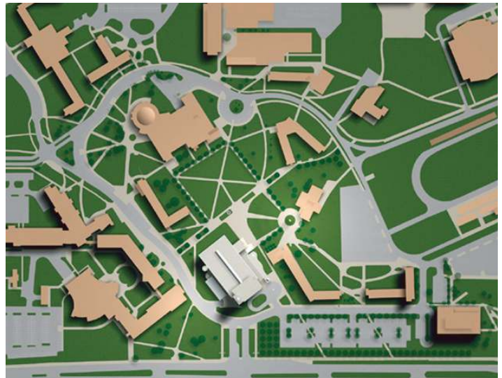
Site plan after