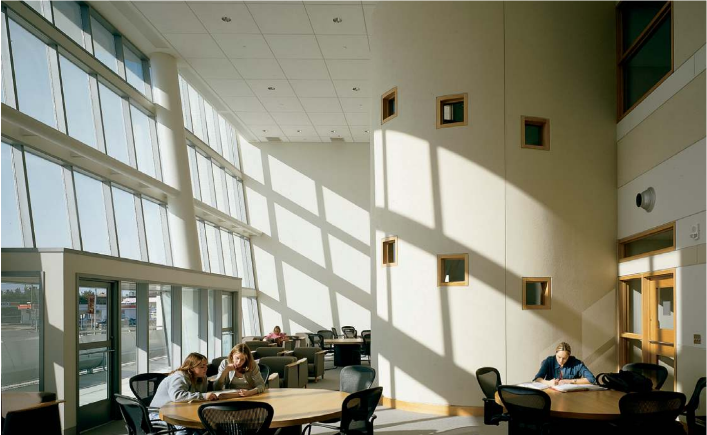
Silent reading room