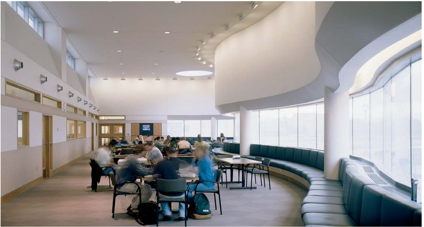
Twenty-four hour study court

FSU Library for Information, Technology and Education (FLITE)