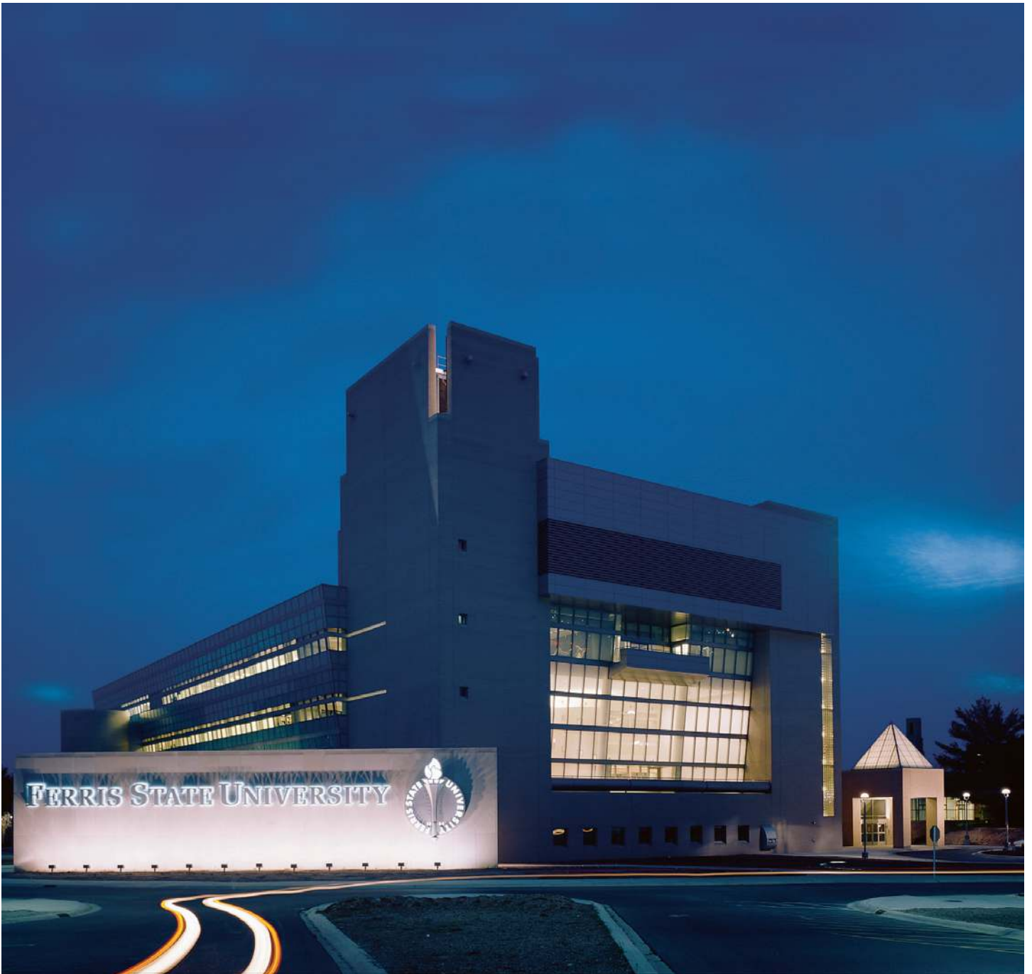
View from northwest from campus entrance