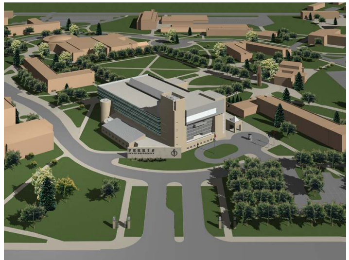
Aerial view from West