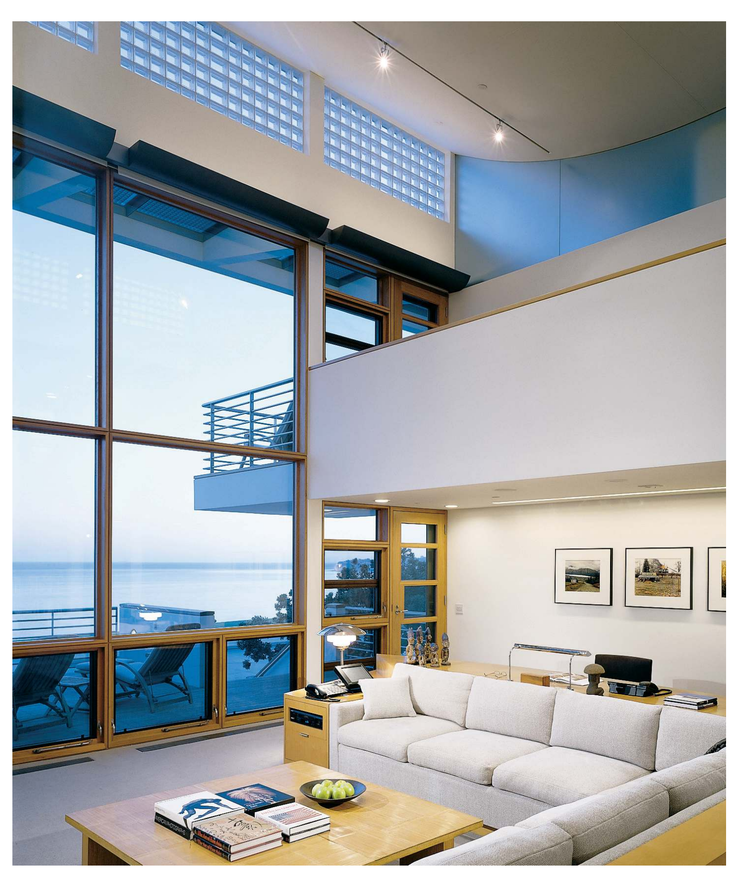
Ocean view from sitting area