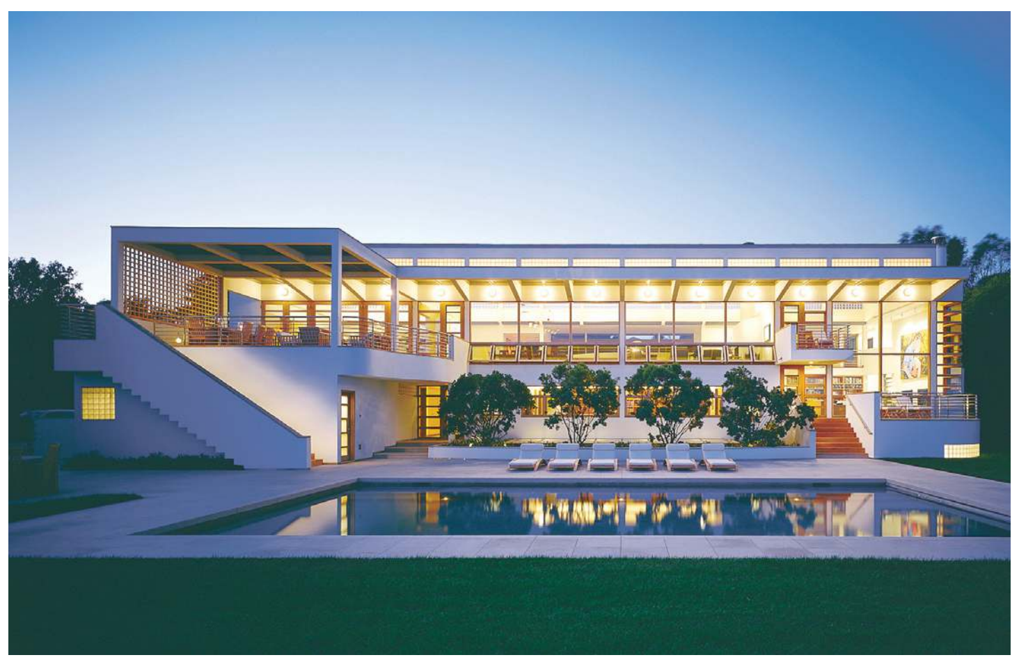
South facade at dusk