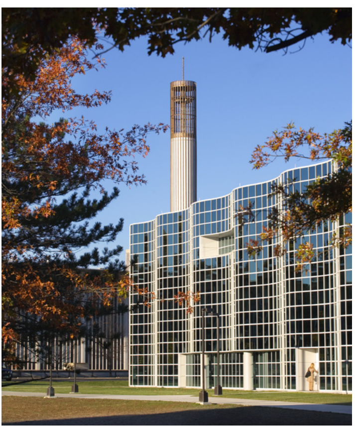
University Hall and the campus carillon