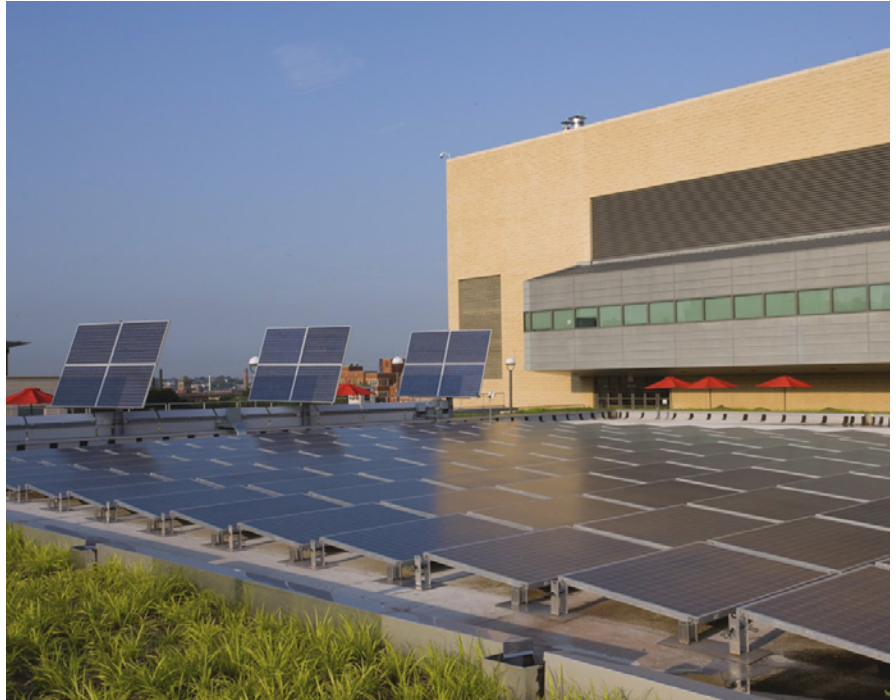
Solar voltaic panels