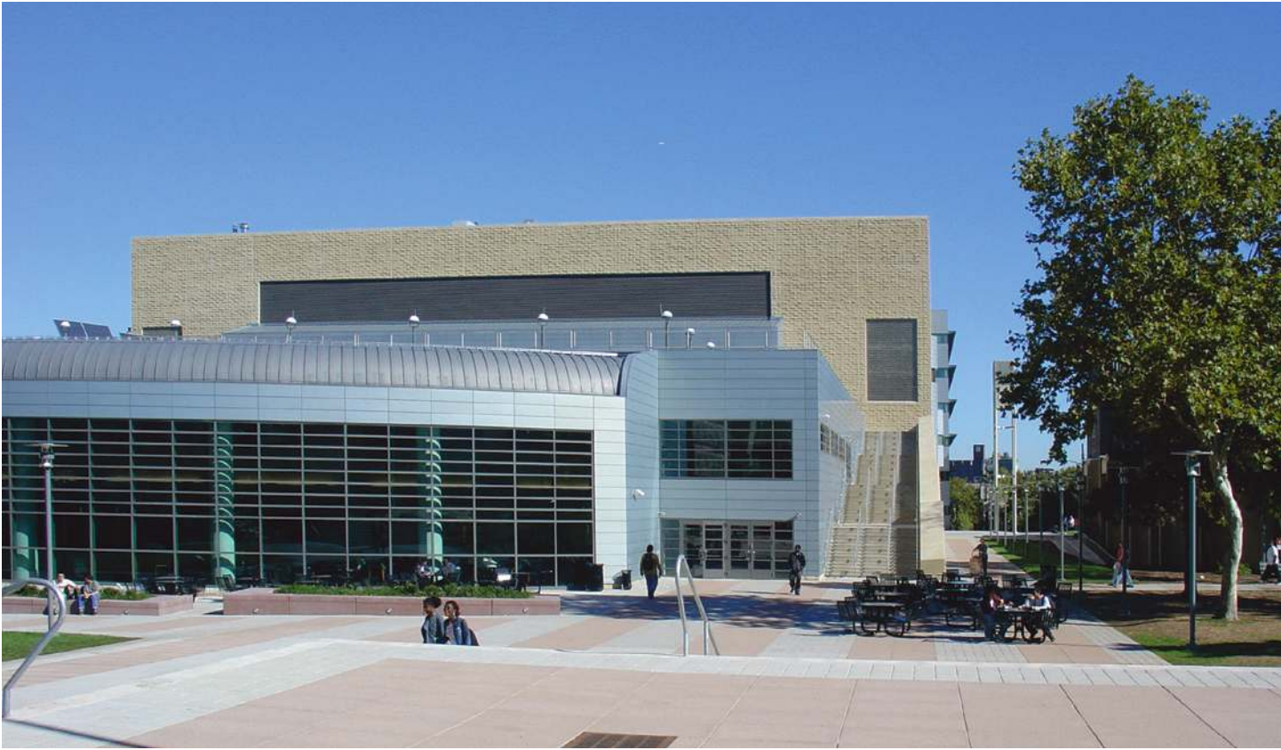
Campus Center entrance