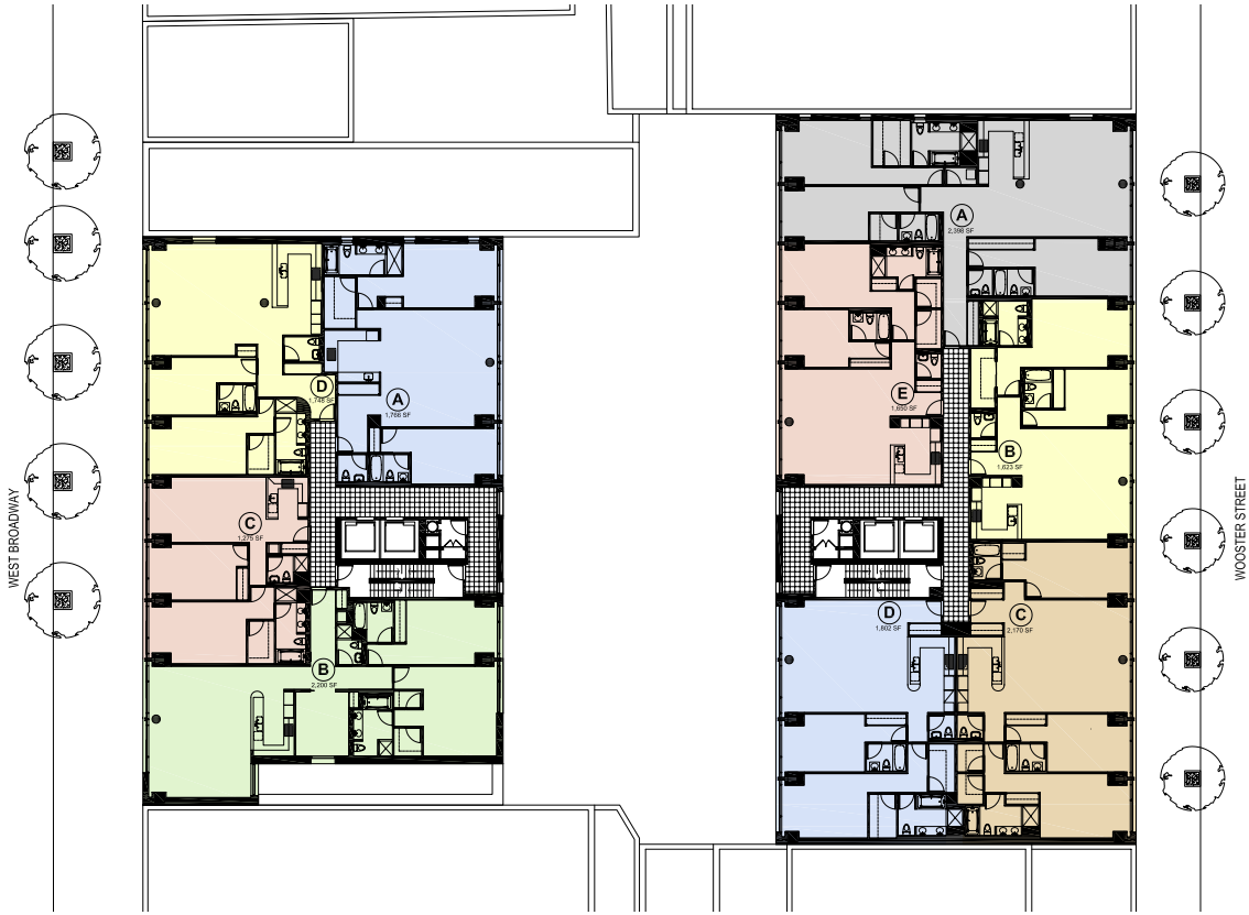
Typical floor plan