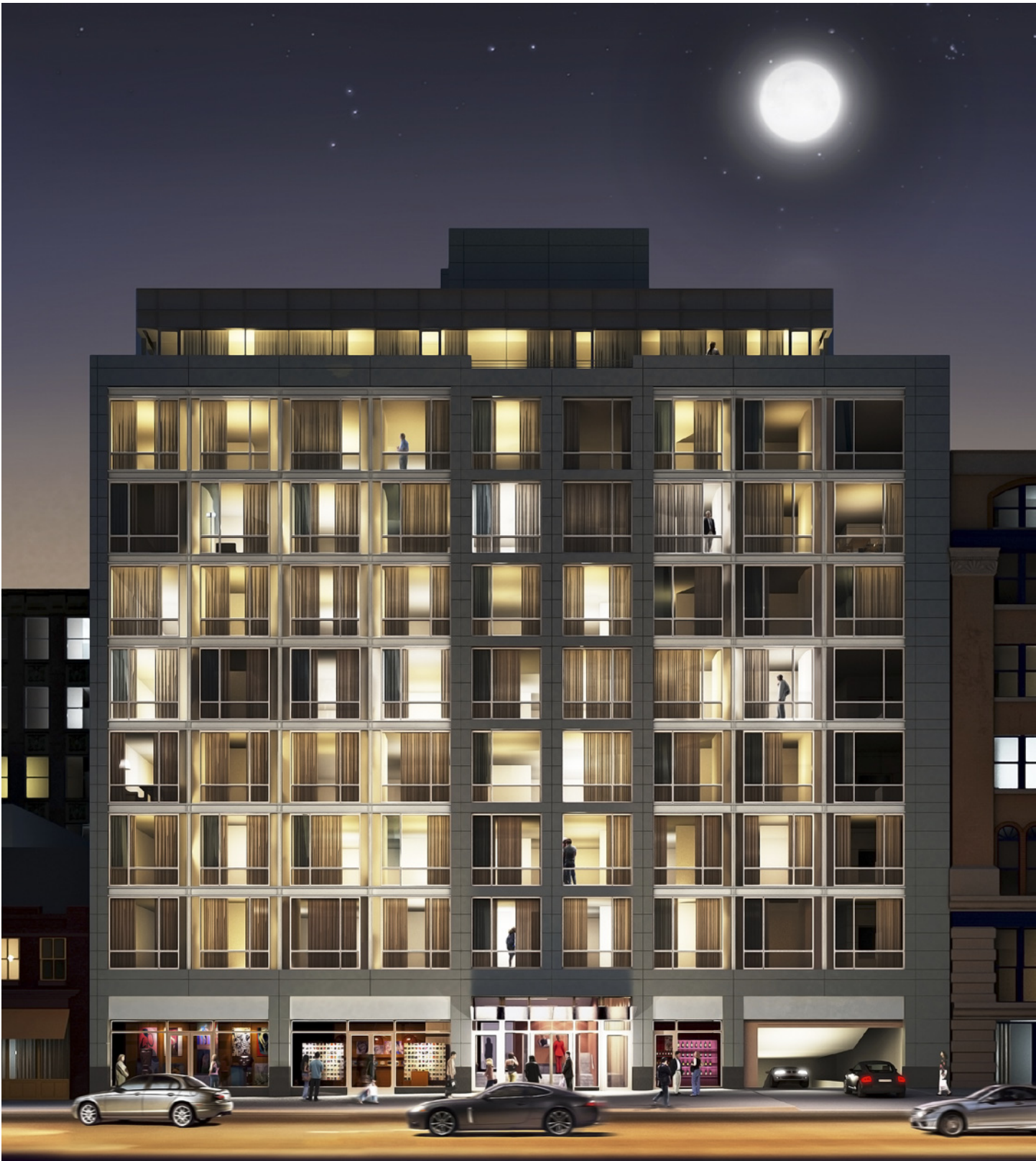
West Broadway façade