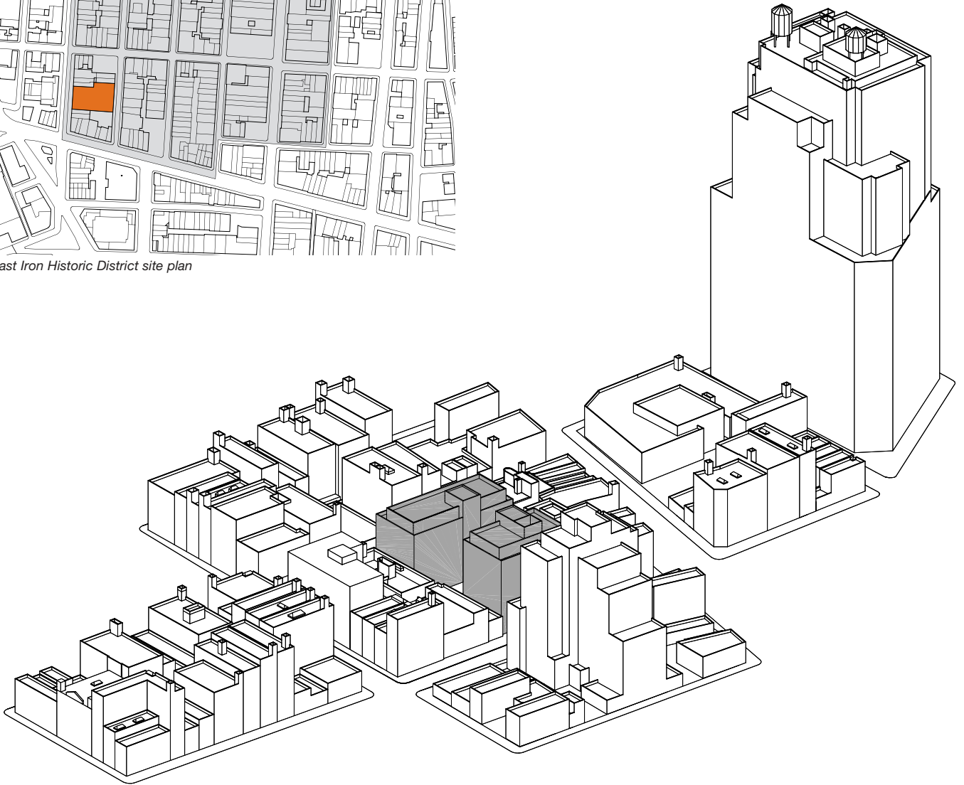
Site context axonometric