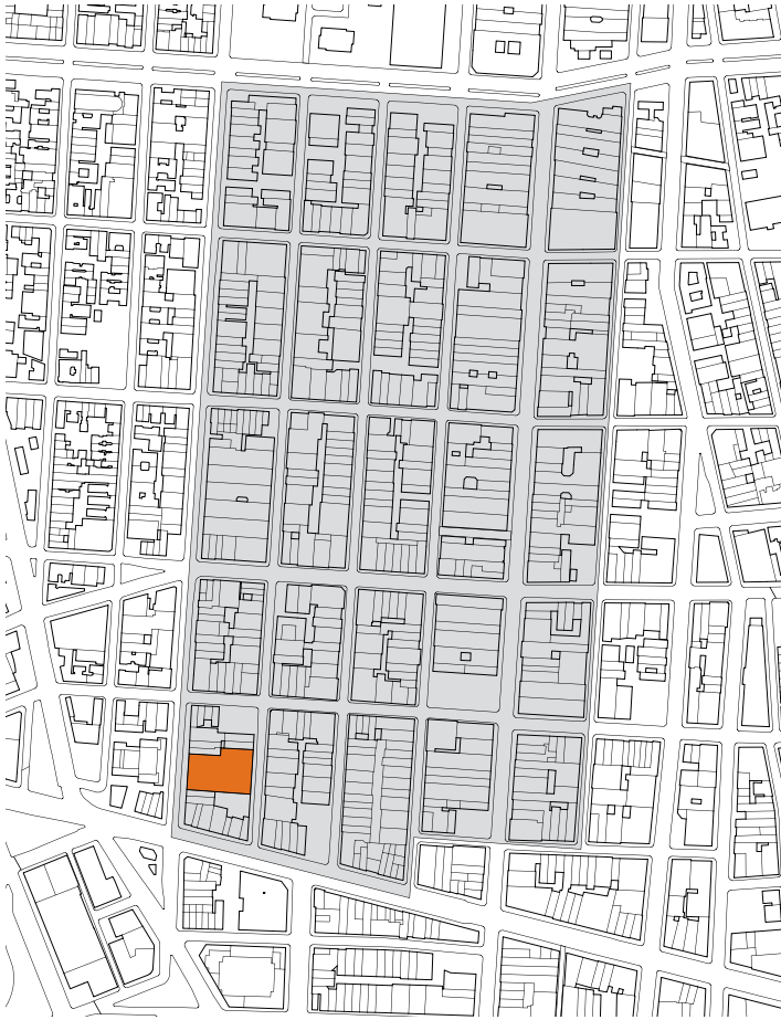
Soho Cast Iron Historic District site plan