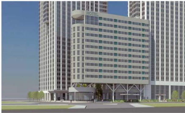
80 Columbus, Jersey City's new premium hotel, will begin construction after the residential towers are completed.