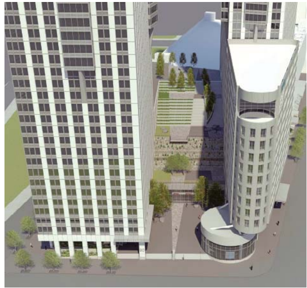
The next phase of the project includes two 50-story premium rental towers, 70 and 90 Columbus as well as a brand-new 144-room hotel, 80 Columbus.